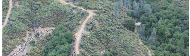
Vang property with cultivation activities

At a Feb. 8 hearing, the Board determined Vang, 41, of Sacramento, failed to restore and monitor his property after Board inspectors found evidence of water quality problems related to the development of the land for cannabis cultivation, including the grading and construction of stream crossings and access roads without obtaining the proper permits.