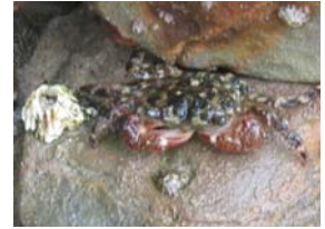
Shore crab at Scripps Coastal Reserve

The Carlsbad HU is comprised of the following six HAs; the Loma Alta, Buena Vista Creek,