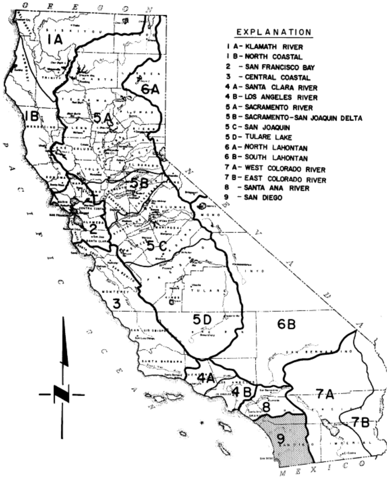
VICINITY MAP, BASIN PLANNING AREAS