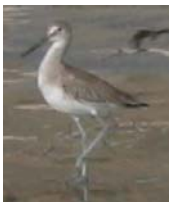
Willet at Tijuana Estuary shoreline

The unit's only coastal lagoon is the Tijuana Estuary which occupies approximately 2,000 acres and is generally open to the ocean. Most of the area can be classified as a salt water marsh with a number of arms of open water. Water quality is generally the same as that of the sea water except during periods of runoff when a variety of wastes, which originate in Mexico, are carried into the lagoon from the surface flow in the Tijuana River.