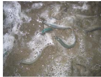
Grunion spawning at Ocean Beach

The Penasquitos HU is comprised of the following five HAs; the Miramar Reservoir, Poway, Scripps, Miramar, and Tecolote HAs.