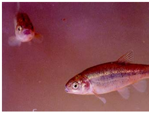
Arroyo chub at Rainbow Creek

The San Luis Rey Unit contains two coastal lagoon areas, the mouth of the San Luis Rey River and Loma Alta Slough. The mouth of the San Luis Rey River is entirely within the city of Oceanside and is adjacent to the city's northern boundary. The slough area at the mouth of the river is contiguous with Oceanside Harbor. Loma Alta Slough is entirely within the city of Oceanside and is the mouth of Loma Alta Creek.