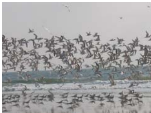
Shorebirds at Tijuana Estuary shoreline

The San Diego Region forms the southwest corner of California and occupies