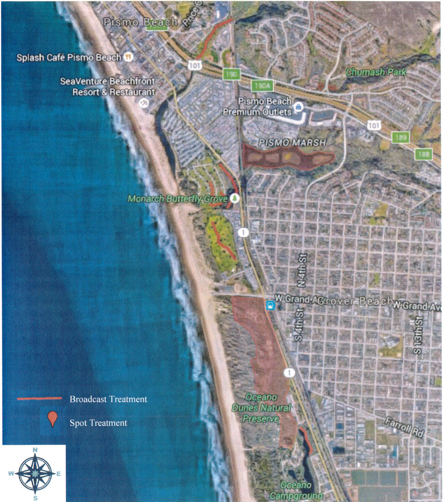
Pismo Beach and Oceano Dunes