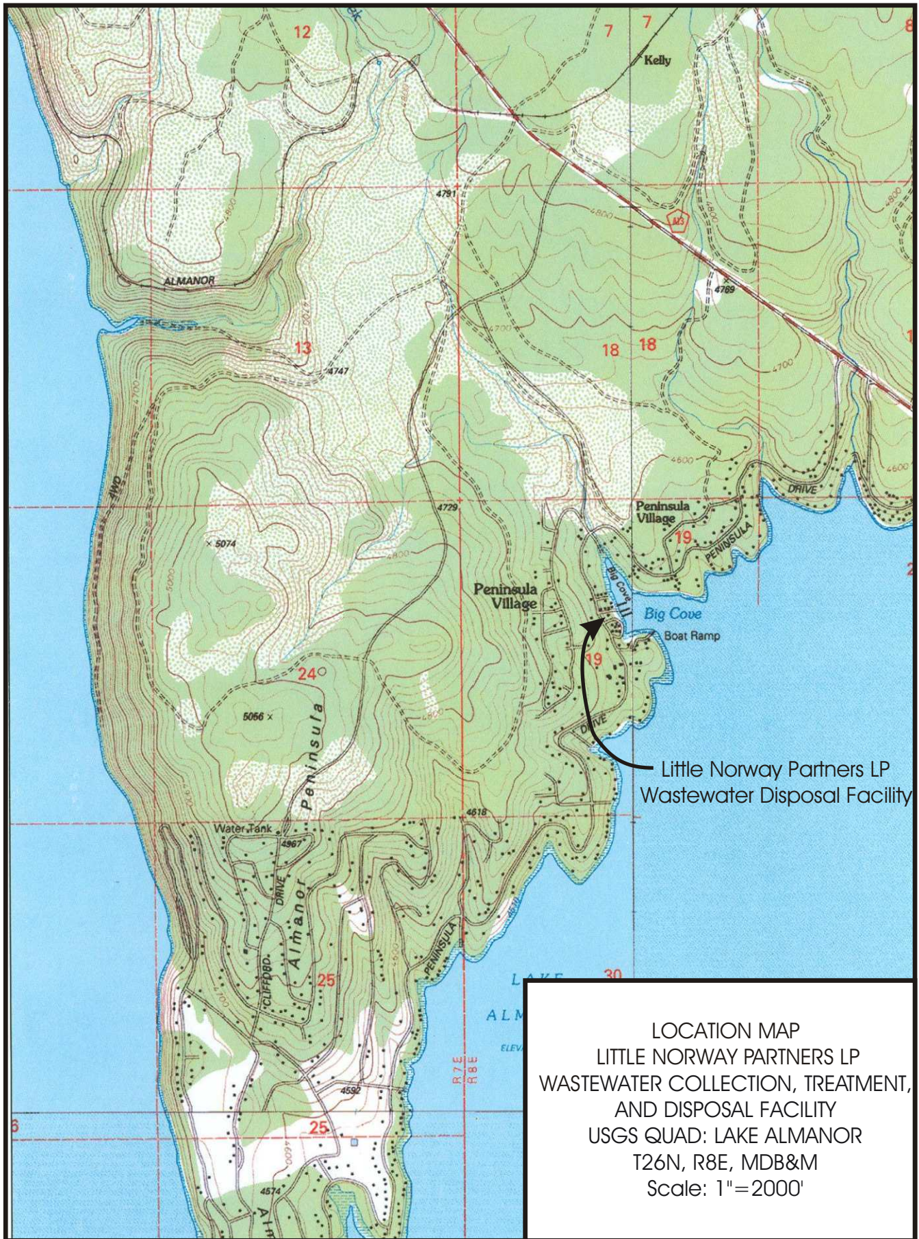
LOCATION MAP LITTLE NORWAY PARTNERS LP WASTEWATER COLLECTION, TREATMENT, AND DISPOSAL FACILITY USGS QUAD: LAKE ALMANOR T26N, R8E, MDB&M Scale: 1"=2000'