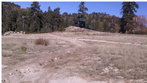
11/15 - Re-installed water bar near top of Chair 12

Snow Valley staff agreed to submit progress reports every other week to the Water Board. The November 6 report showed they are making progress on slope repairs (see the photographs below) and have stocked up on fiber rolls and jute matting to be ready for run-off events. Jute matting is an excellent BMP for erosion control on steeper slopes. Water Board staff will continue to monitor progress following review of the recently submitted Erosion Management Plan.