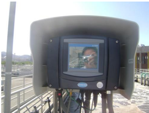
VVWRA – New Process Control Equipment

Aeration modifications - Air control throughout the aeration basins was improved to establish and maintain aerobic and anoxic treatment zones. Aeration is the single largest power demand in a wastewater treatment plant because of power consumption to drive air compressor blowers. New diffusers and air blowers optimize the anoxic conditions that support denitrification for biological nutrient removal.