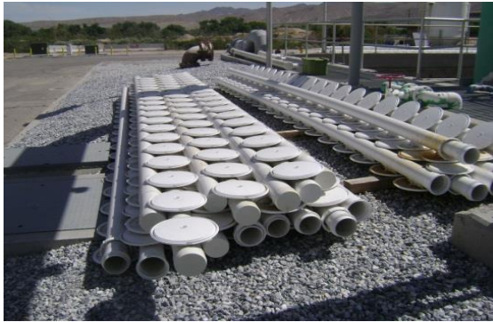
VVWRA – New Aeration Basin Air Diffusers

Aeration modifications - Air control throughout the aeration basins was improved to establish and maintain aerobic and anoxic treatment zones. Aeration is the single largest power demand in a wastewater treatment plant because of power consumption to drive air compressor blowers. New diffusers and air blowers optimize the anoxic conditions that support denitrification for biological nutrient removal.