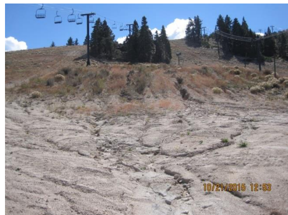
10/15 - Erosion on "Big Bowl" slope

and through the parking lot into the south fork of Deep Creek. The October inspection found many locations with serious erosion problems. The sedimentation basin down gradient of the parking lot, which serves as the last catch for silt run-off, was completely full. Snow Valley staff shared draft plans and a schedule for repairs and installment of permanent BMPs. The schedule called for immediate repair of all problem areas identified in our inspections continuing through 2015. The most important best management practice, a permanent sedimentation basin on the west side of the parking lot, will not be installed until next spring. The following photographs illustrate some of the erosion problems found in October 2015.