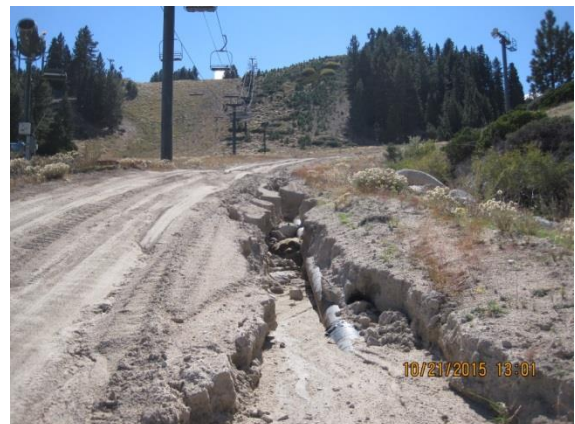
10/15 - Erosion exposing water line between a reservoir and storage tank for snow making