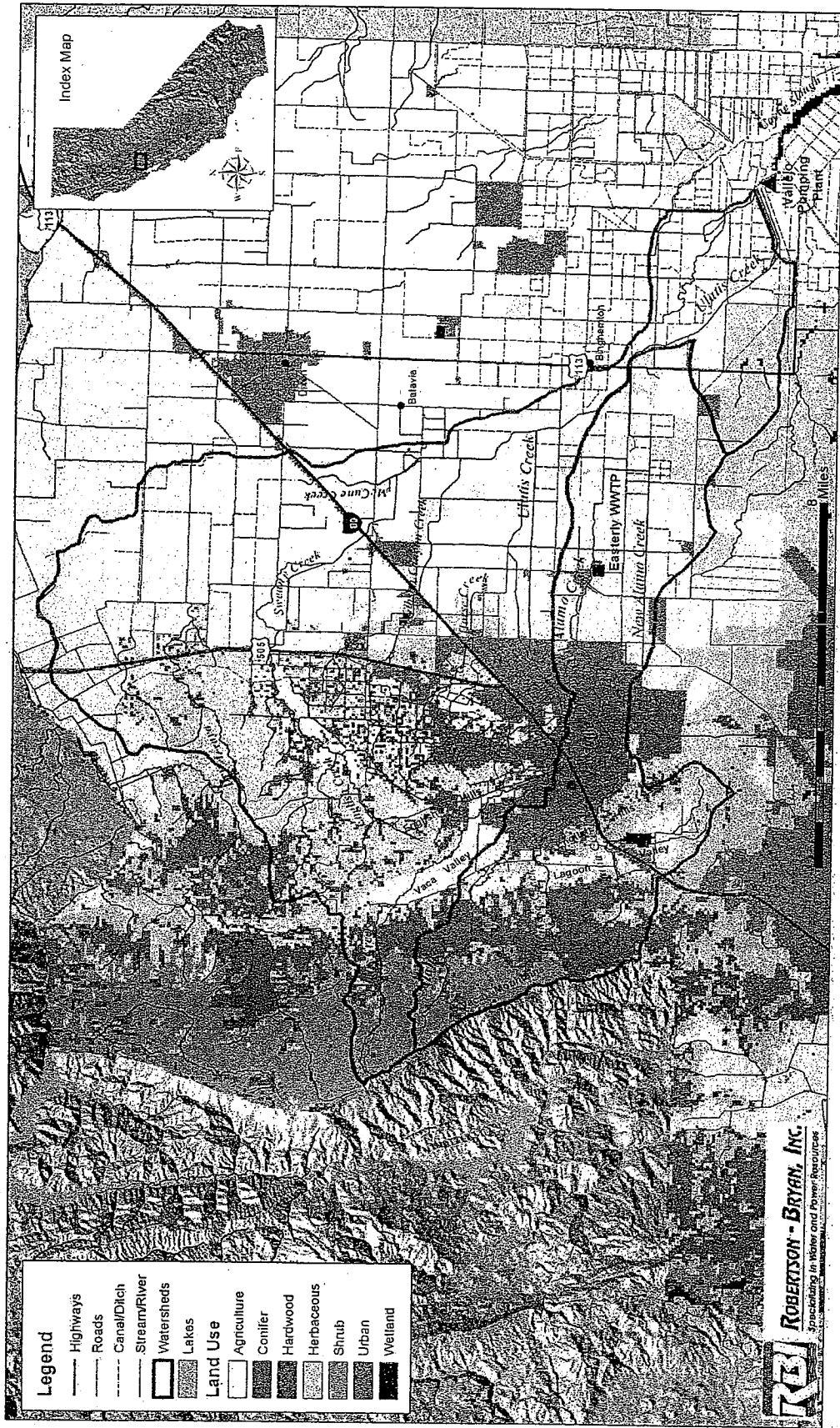
Figure 10. Land use categories in the New Alamo and Ujatis Creek watersheds.