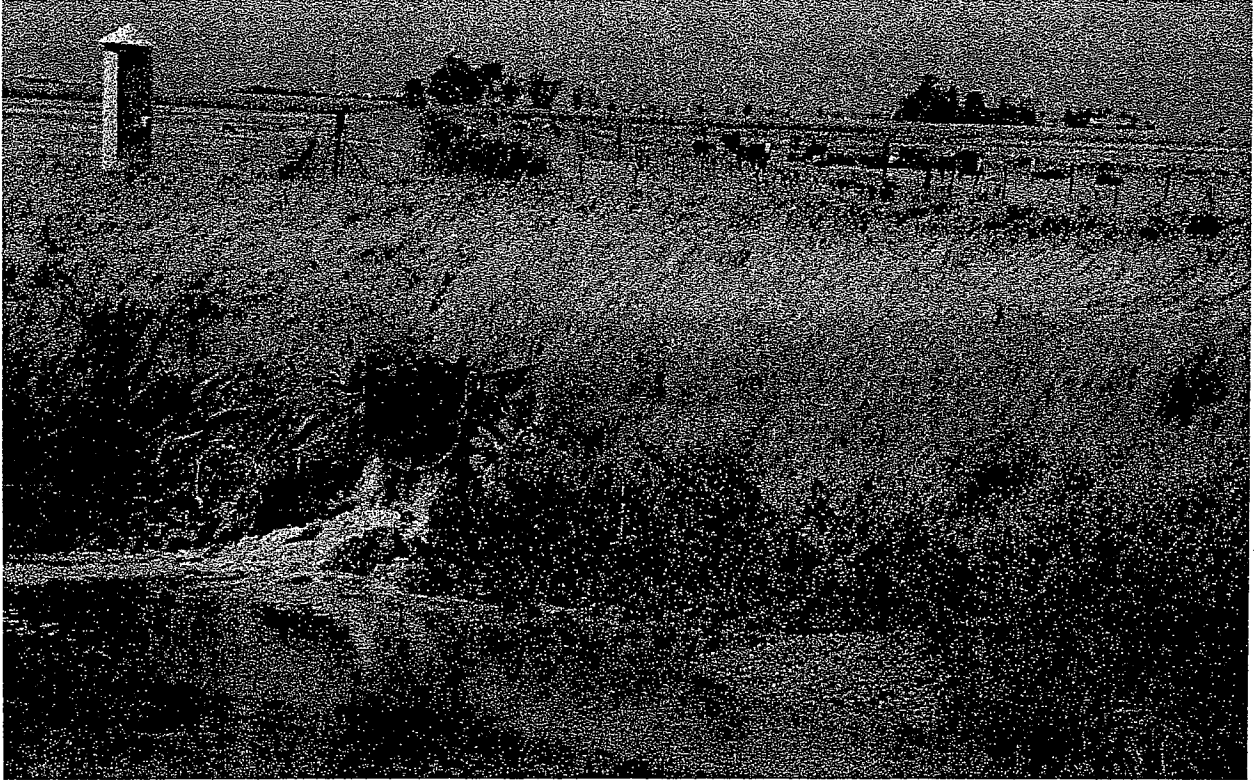
Figure 12. Agricultural return flow into Ulatis Creek upstream of Cache Slough.