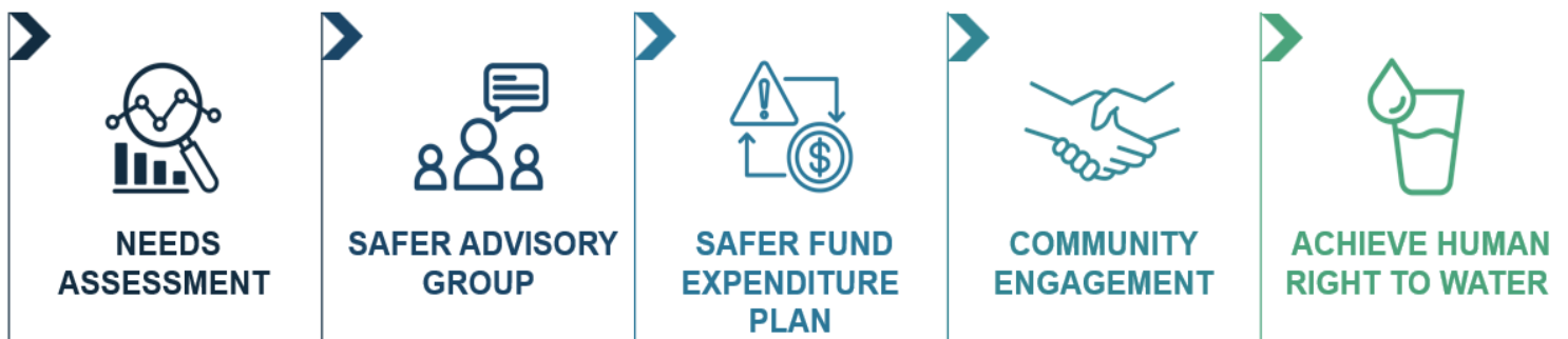
Figure 2. Needs Assessment and the SAFER Program

The Needs Assessment is not a static analysis. The State Water Board annually updates the Needs Assessment, and it provides a valuable snapshot of the overall resources needed to bring Failing systems into compliance with drinking water standards and prevent At-Risk water systems from failing.