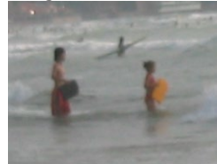
Beachgoers at La Jolla Shores

Hydropower Generation (POW) - Includes uses of water for hydropower generation.