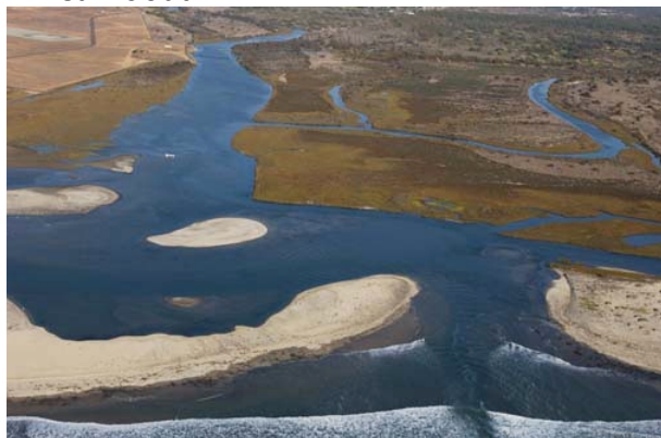
Tijuana River mouth

Copyright © 2002-2004 Kenneth & Gabrielle Adelman California Coastal Records Project www.californiacoastline.org