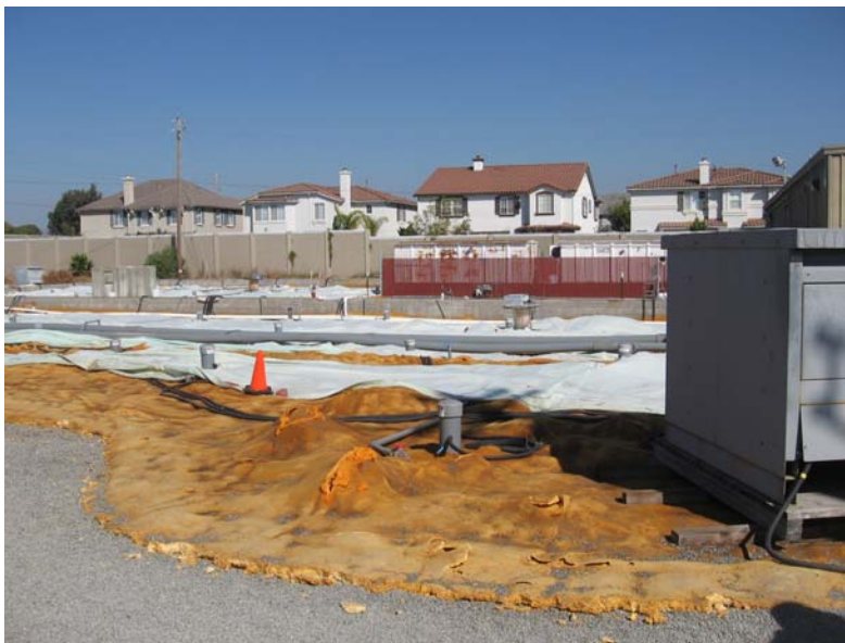
Photo of the site in Newark where electrical resistivity heating is being implemented. Brown insulation foam and white plastic cover the treatment field to help retain the heat in the shallow subsurface. The site is immediately adjacent to residences.

One discharger is successfully using a sophisticated in-situ technology called "electrical resistivity heating" for onsite soil and groundwater contamination. In this process, subsurface soil and groundwater are heated to nearly 100°C. The heat causes the underground contaminants and water to evaporate, creating steam and vapor that are extracted and brought to the surface for treatment. The system has removed over 3,000 pounds of contaminant mass since startup in March 2010. The costs, while high in the short-term, compare favorably with other technologies that take much longer and require disposal of extracted groundwater or excavated soil. The discharger will also use in-situ chemical oxidation to address off-site shallow groundwater contamination.