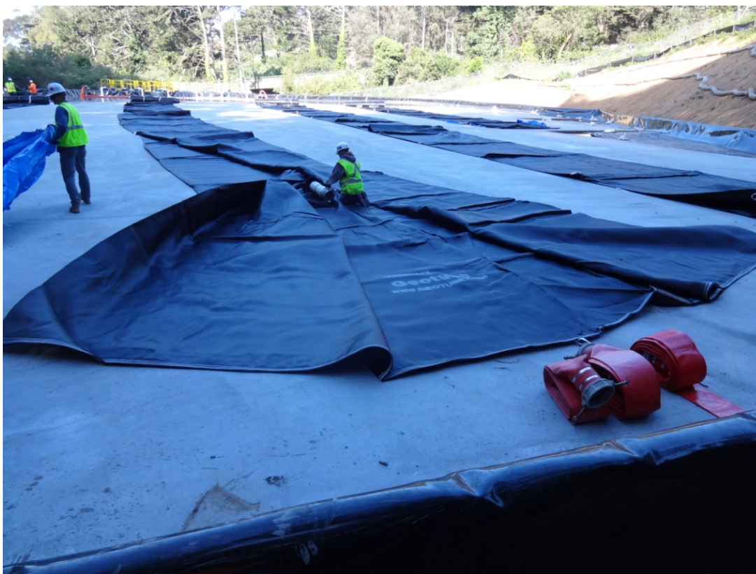
Figure 1. Geotextile dewatering bags called geotubes are laid out in the cramped dewatering area. Sediment slurry mixed with chemical polymers will be pumped into the bags for dewatering near Mountain Lake.

Sediment is being removed with a hydraulic dredge and transported through a pipeline to a dewatering area. Due to space constraints, the sediment slurry is being pumped into long geotextile bags, called geotubes, which are stacked to form a pyramid while the water drains out. To speed up the process, chemical polymers are added to the sediment slurry prior to pumping it into the geotubes.