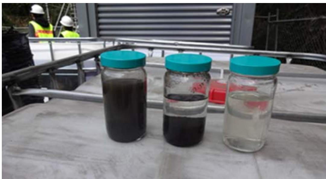
Figure 3. (left) Sample of sediment slurry; (center) sample taken after chemical polymers were added to the sediment slurry; (right) sample taken after water treatment prior to discharge back into Mountain Lake.

As part of the remedy, Caltrans stabilized Highway 1 to protect the roadway from failure during dredging operations. Caltrans will also treat stormwater runoff from Highway 1 to prevent recontamination of the lake. Board staff is working with Caltrans and the Presidio Trust to permanently divert stormwater runoff. After remediation is completed, the Presidio Trust will begin restoration of Mountain Lake. Restoration goals include removal of non-native fish, reductions in nutrients and algal blooms, and restoration of native flora and fauna, particularly submerged aquatic vegetation.