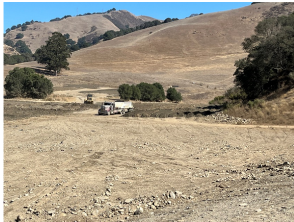
Figure 2: Bio-farming of soil stockpile on 10/10/2022