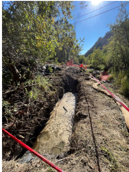
Figure 1: Remediation trench. Interstitial channel and Alameda Creek are to the right of the trench on 10/14/2022.

SF Bay Water Board staff will conduct regular inspections and ensure compliance with the Order, creek cleanup and safe reuse or disposal of the treated soil.