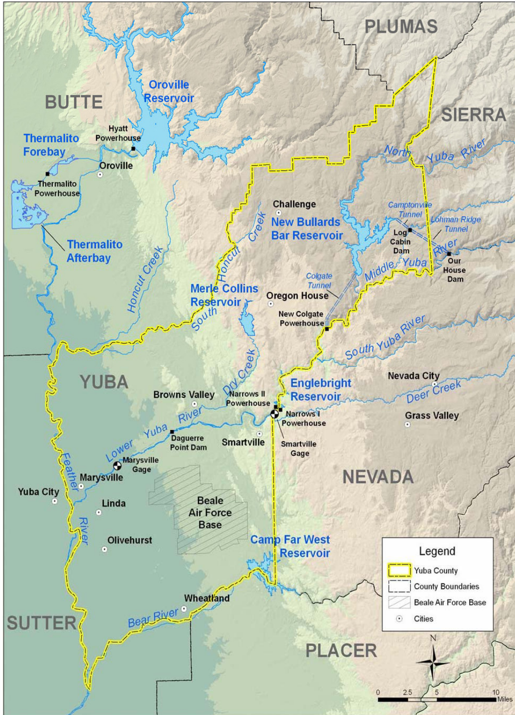
Figure 1-1. Major Water Development Facilities in the Lower Yuba River Basin