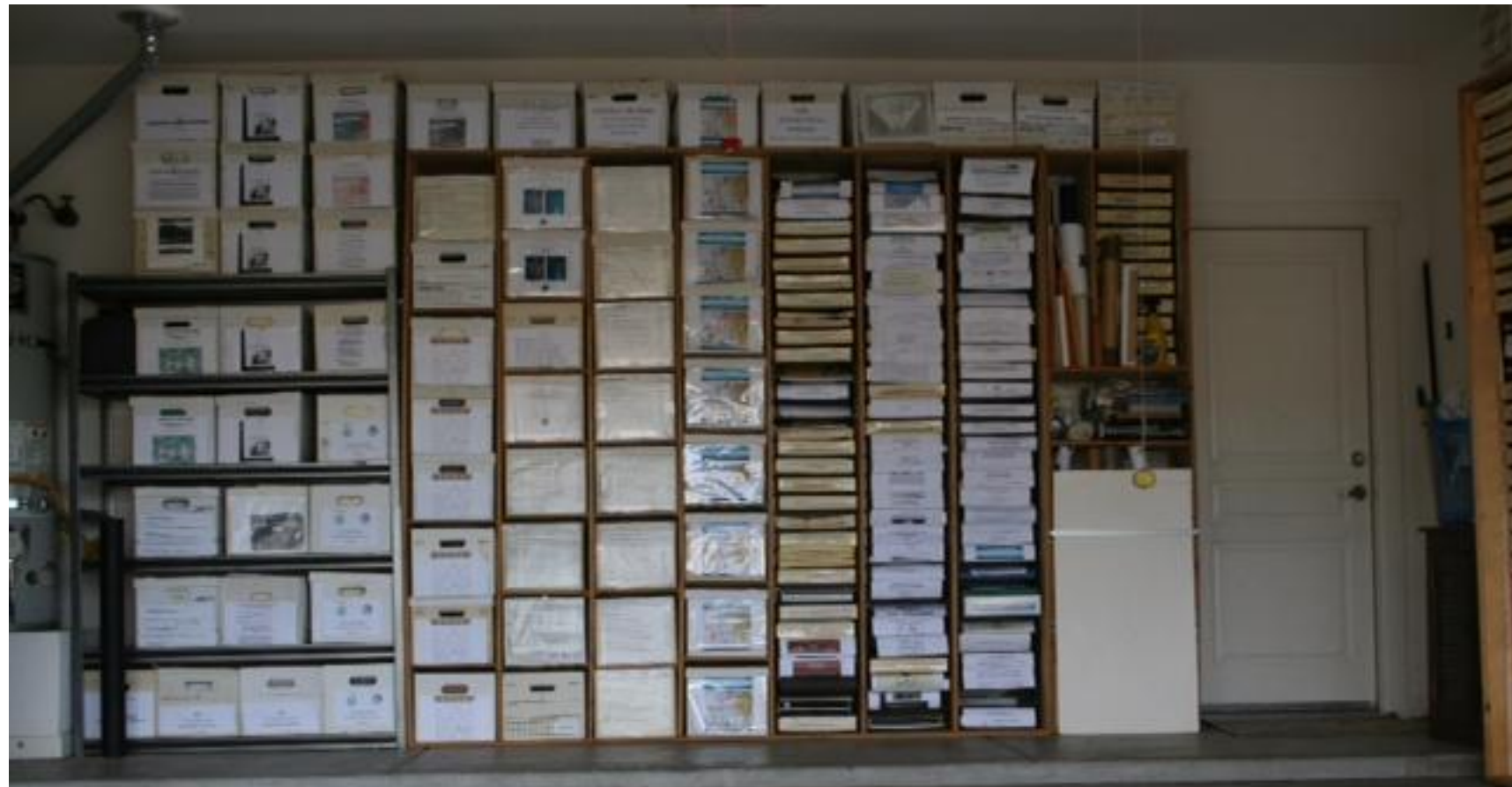
These three pictures were presented by Patrick Porgans at the State Water Resources Control Board's April 9, 2013 informational agenda item.