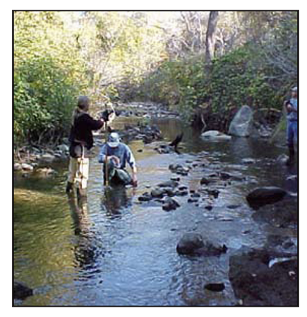
North Coast Regional Water Board staff monitoring water quality.

The Water Boards enforce pollution control requirements that are established for discharges. Where violations of regulatory requirements are detected, enforcement actions of varying types and severity are taken. For the most serious violations, penalties are often imposed. In all cases, the goal of enforcement is to encourage compliance with requirements so that water quality is protected. This part of the Performance Report presents data and information on violations, enforcement actions, and penalties.