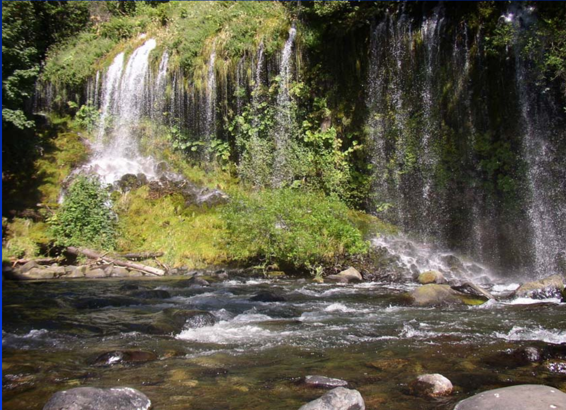
Sacramento River Above Dunsmuir