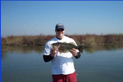
RB5 Fisherman w/ largemouth bass