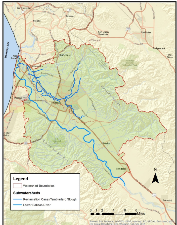
Lower Salinas River Watershed