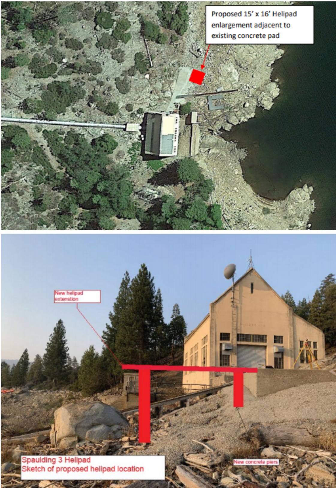
Figure 2 – Project Site Map