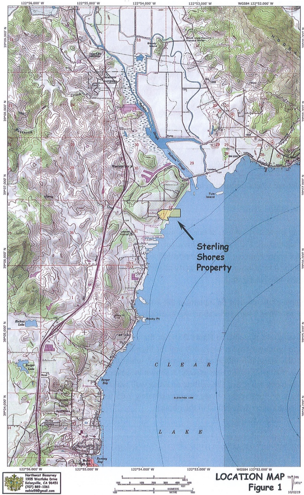
Figure 1 – Project Location Map