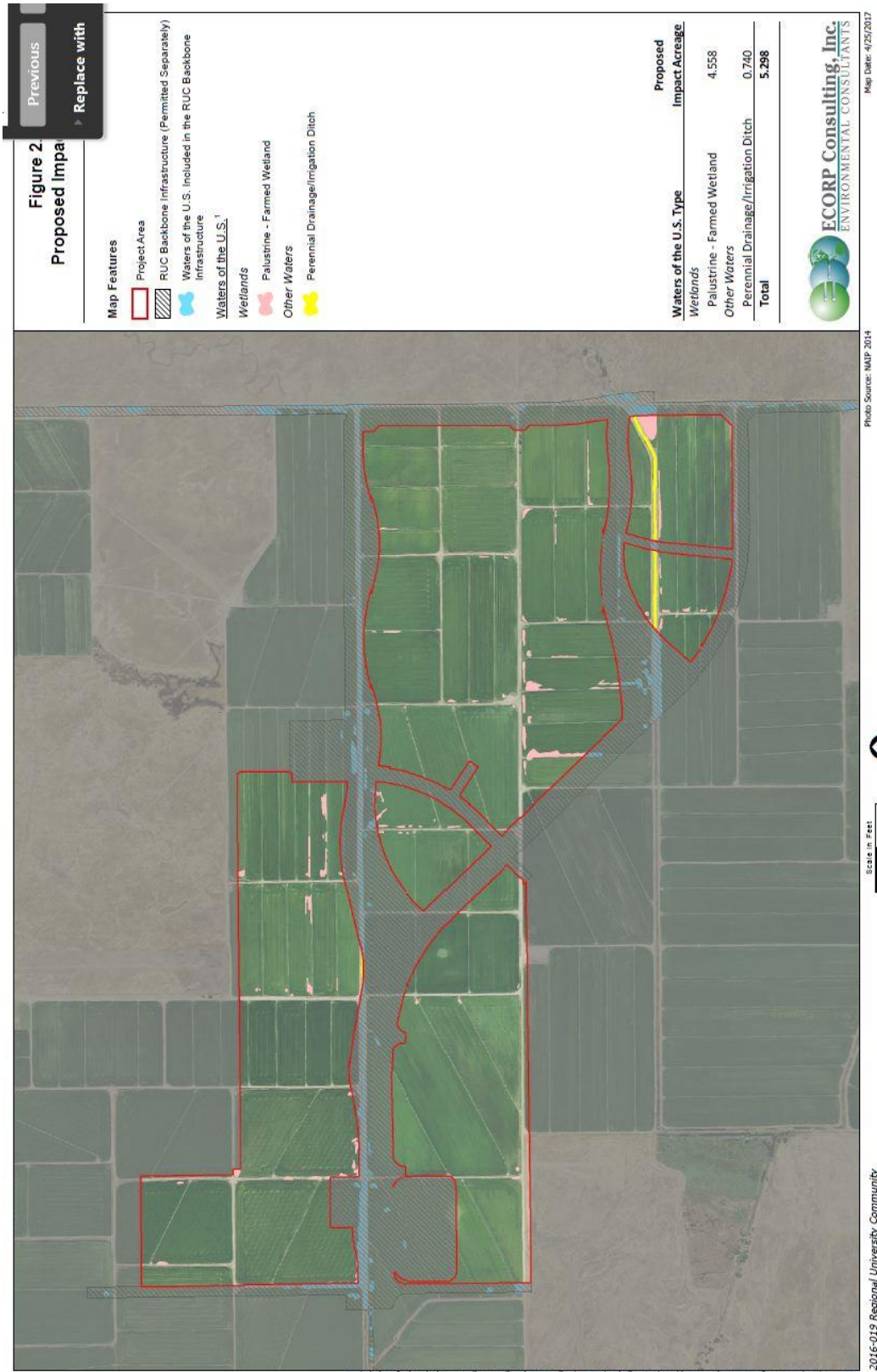
Figure 2 – Project Site Map