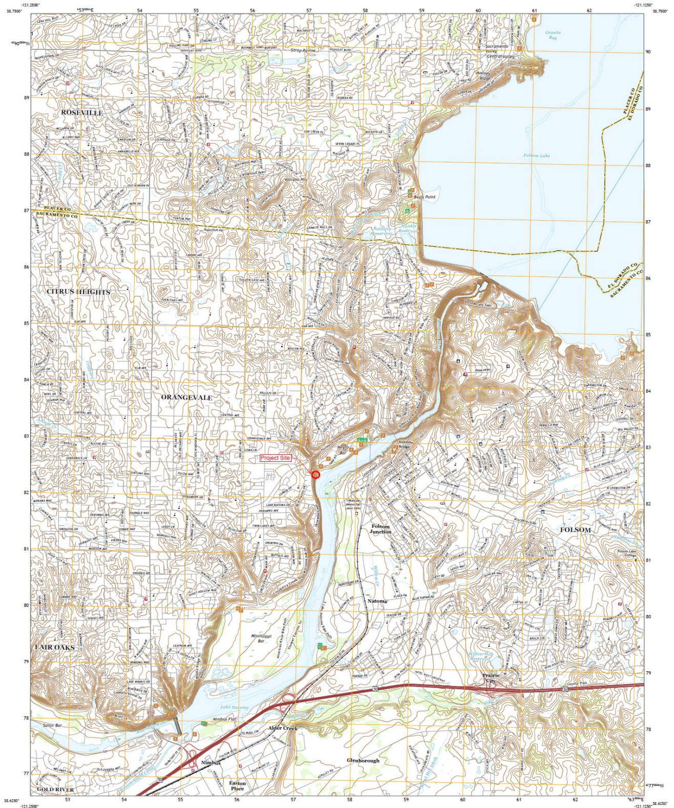
Figure 1 – Project Location Map