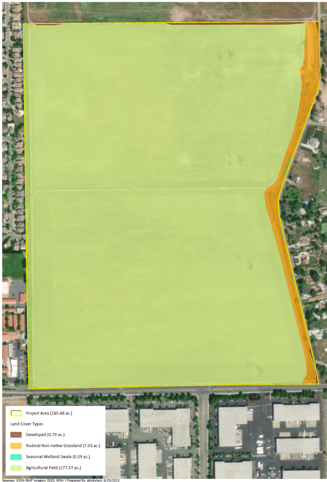
Figure 2: Site Map