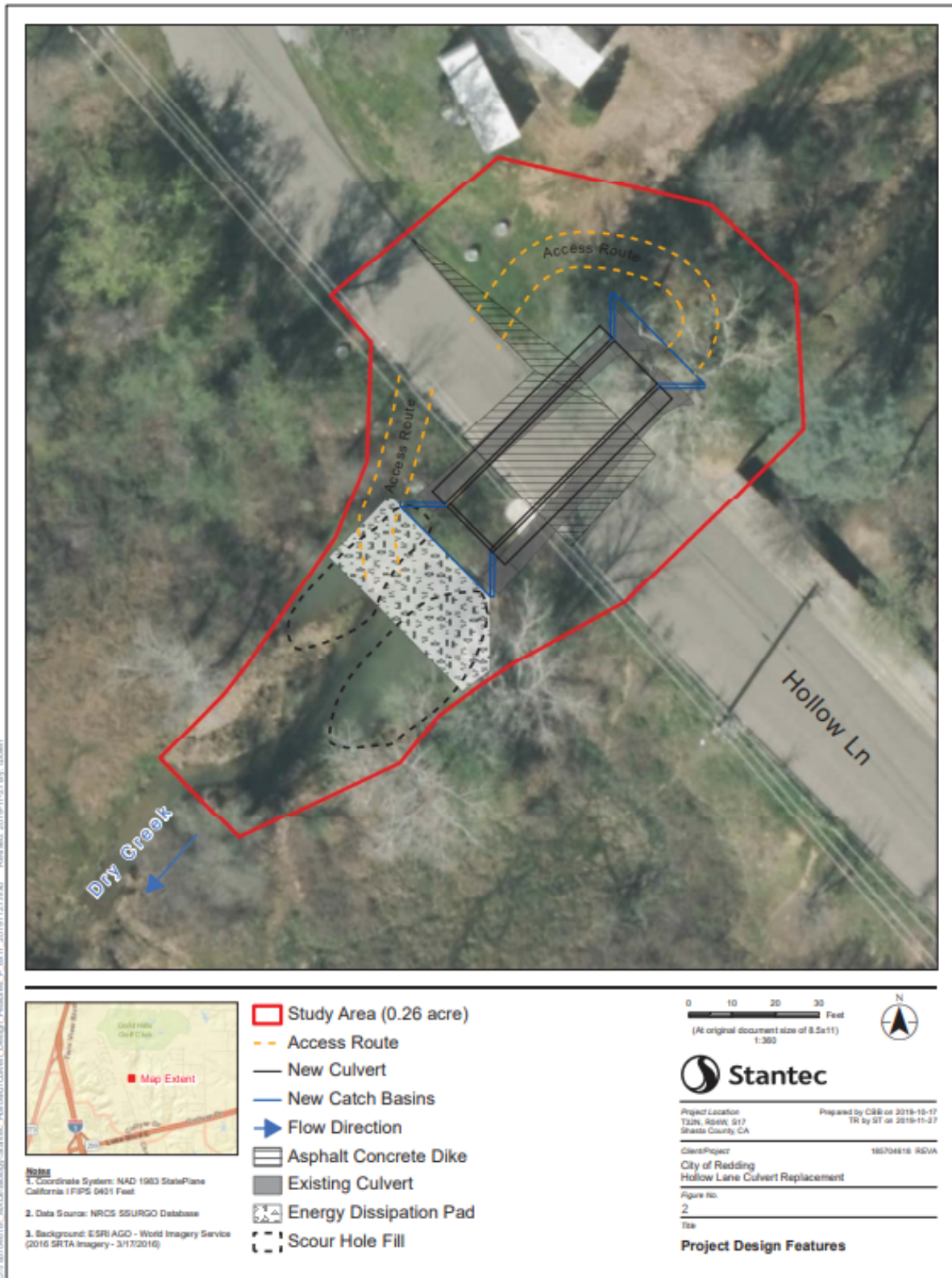
Figure 2. Project Location and Study Area