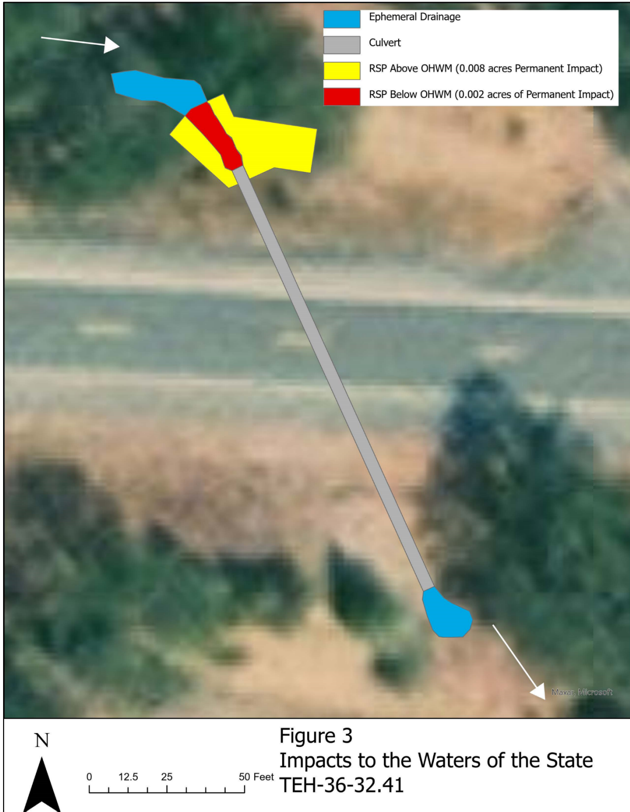
Figure 3: Project Impacts Map TEH-36-32.41