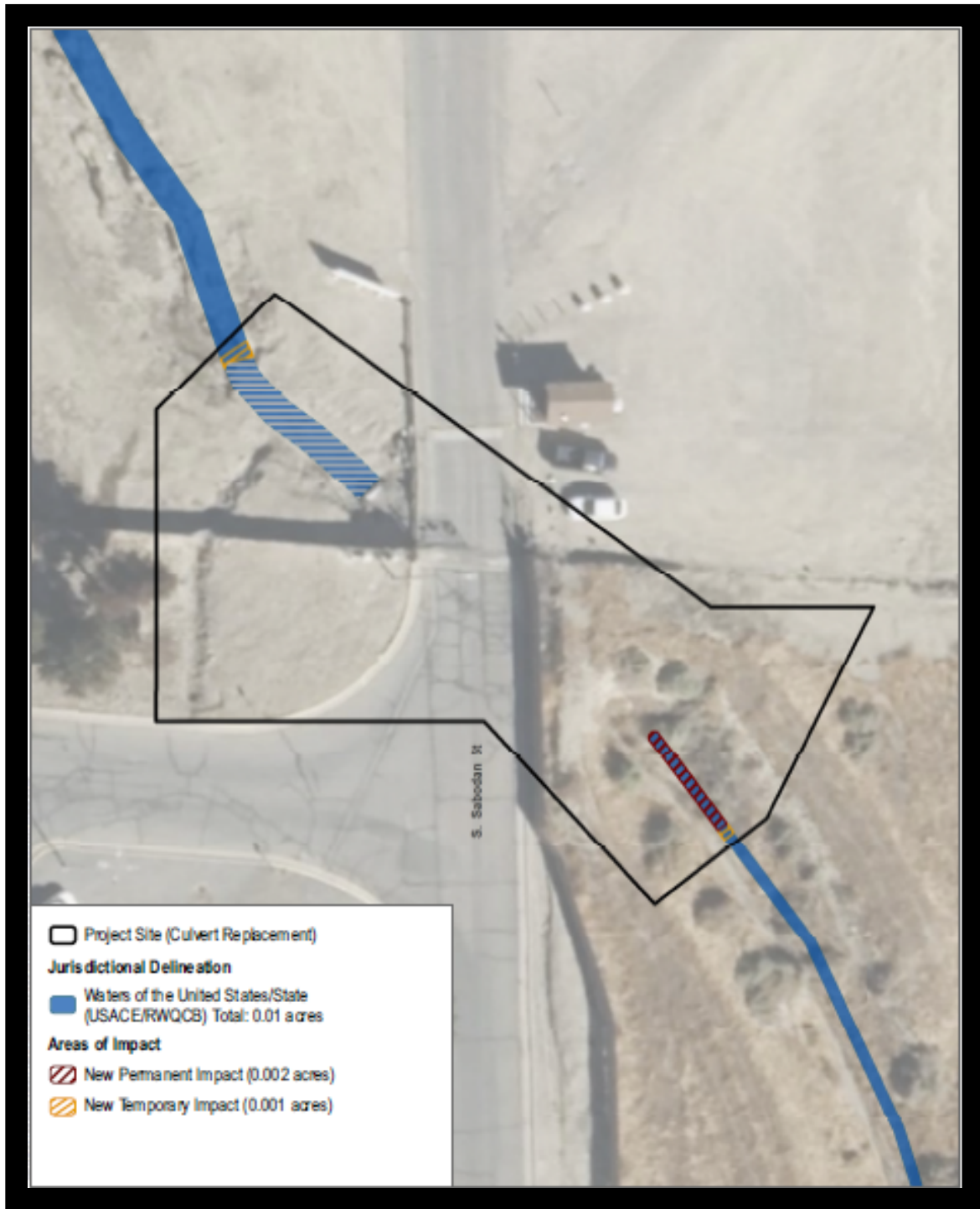
Figure 2: Project Area and Proposed Impacts