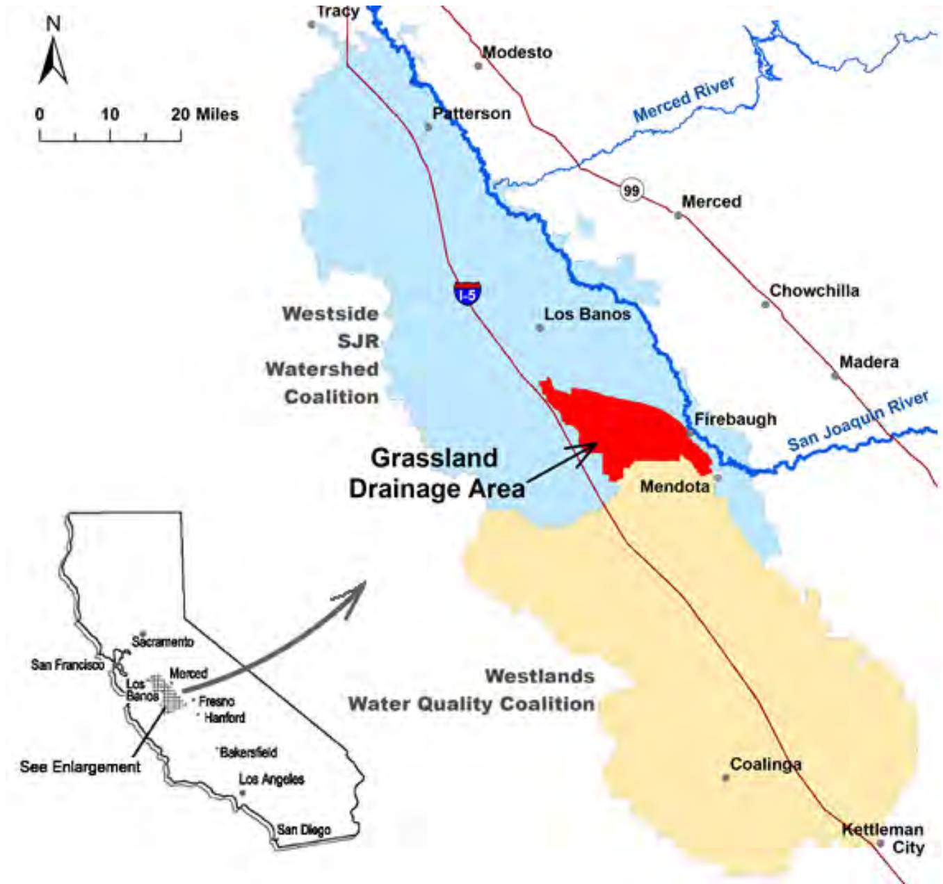
Figure 1 - Location of the Grassland Drainage Area

The Grassland watershed overlies the Delta-Mendota groundwater subbasin which consists of the Tulare Formation, terrace deposits, alluvium, and flood-basin deposits. The Grassland Drainage Area primarily overlies the Tulare Formation. The primary aquifer system occurs in unconsolidated alluvial and continental deposits of the Tulare Formation. The Tulare Formation is composed of beds, lenses, and tongues of clay, sand and gravel that have been alternately deposited in oxidizing and reducing environments. The Corcoran clay of this formation underlies the basin at depths ranging from 100 to 500 feet and acts as a confining bed.