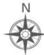
Figure Reference: Google Earth, 2018