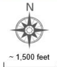
Figure Reference: Google Earth, 2018