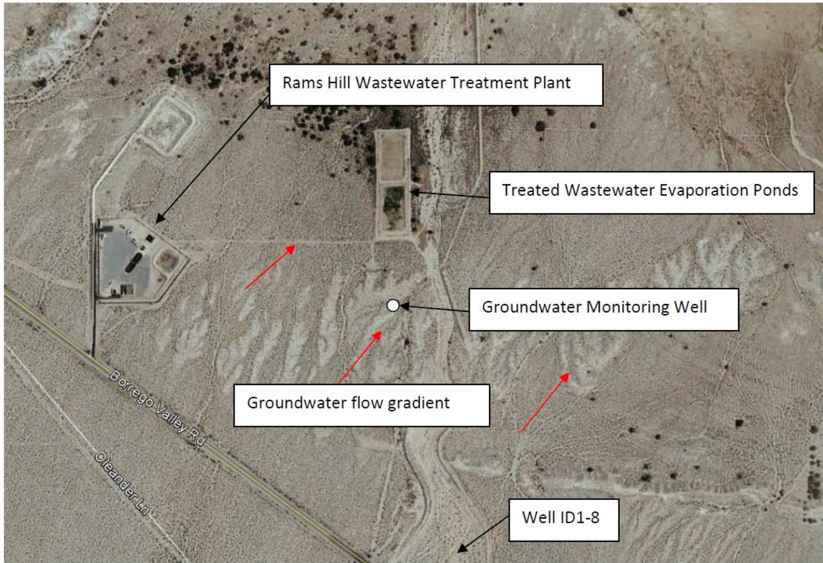
Site Map with Location of Groundwater Monitoring Well