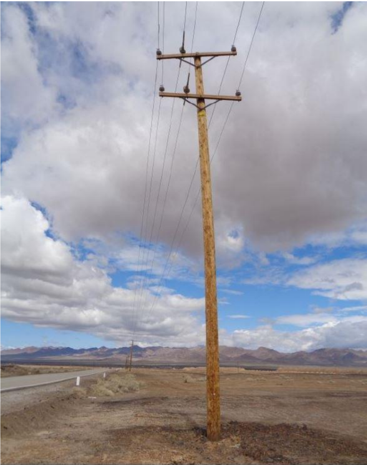
Photograph 3. Image of power poles being replaced.