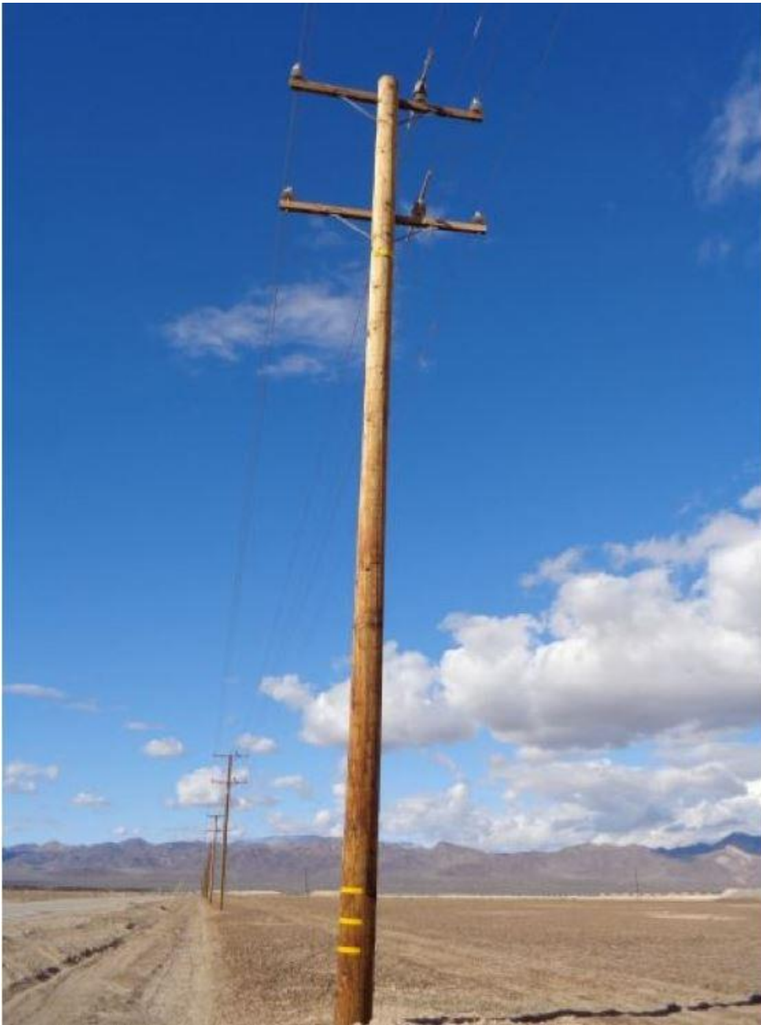
Photograph 2. Image of power poles being replaced.