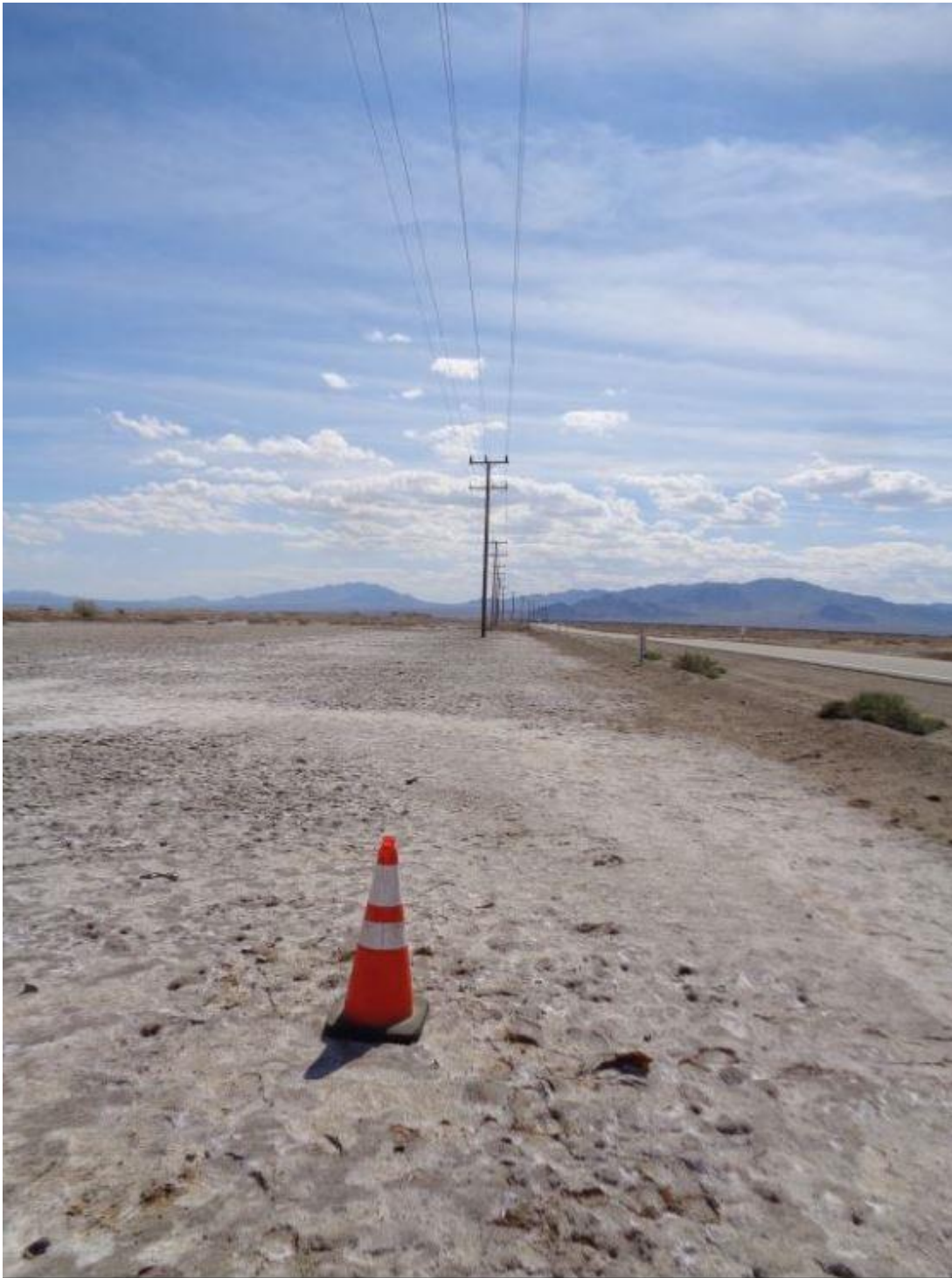
Photograph 1. Image of power poles being replace. Traffic cone shows location of a new pole installation.