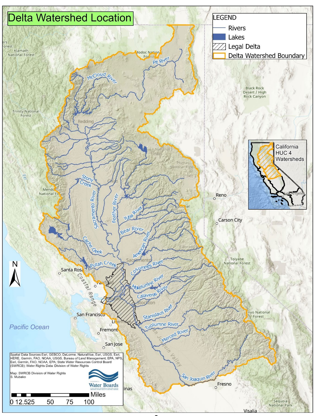
Figure 1: Delta Watershed Location