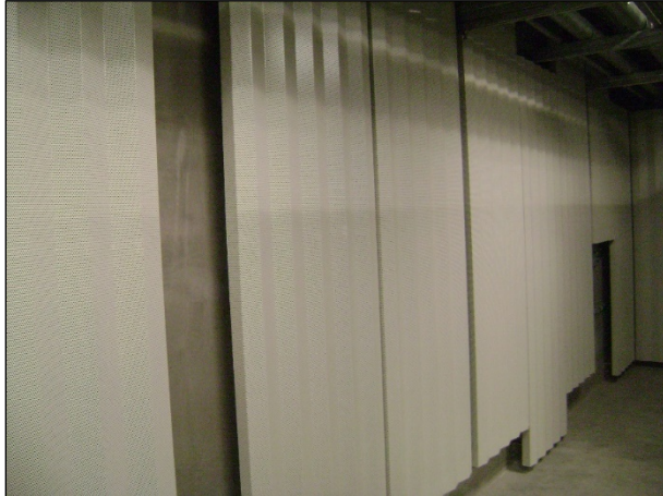
The Apple Valley Sub-Regional wastewater treatment plant uses acoustical paneled walls in the equipment room where noisy blowers are located to minimize noise.

Any unwanted odors generated will be treated by diverting the odorous air to bio-filters that remove the odors.