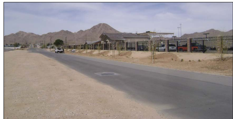
The Apple Valley Sub-Regional wastewater treatment plant has a low profile and its appropriate architecture makes the plant blend into the neighborhood.

The Apple Valley Sub-Regional Wastewater Treatment Plant is designed to be a good neighbor facility. Much of the plant is actually below ground to deaden the sound of pumps and blowers. The visible portion of the plant is no taller than a two story home and the surrounding grounds are landscaped to blend in with the rest of the area.