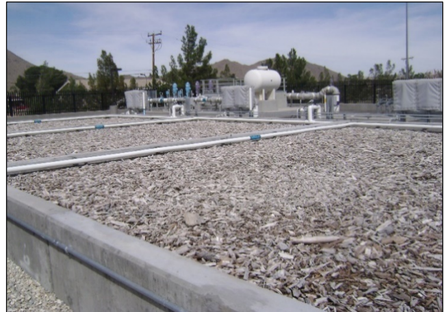
Bio-filters consisting of wood chips are used to scrub odorous air from the underground equipment rooms.