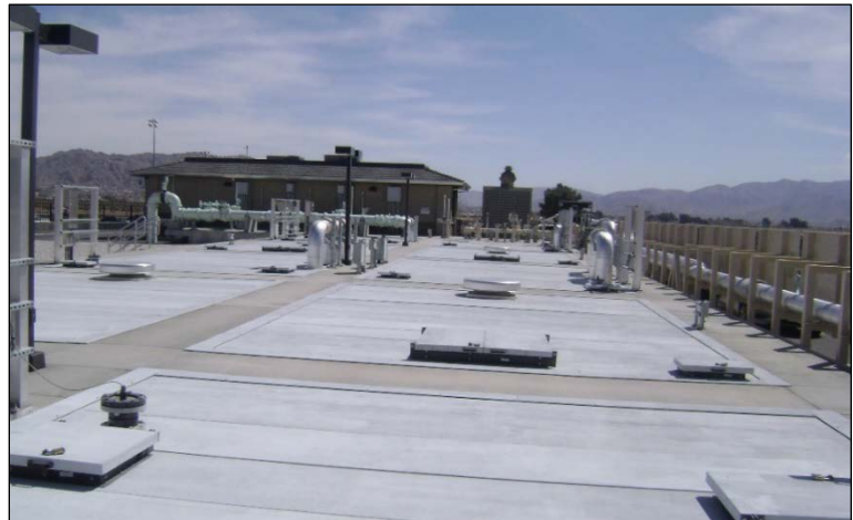
Photograph of the Apple Valley Sub-Regional wastewater treatment plant showing fully covered aeration basins where biological treatment occurs and advanced odor control technology to eliminate unwanted odors.

After twenty years of planning and two years of construction, the Victor Valley Wastewater Reclamation Authority (VWVRA) is now operationally testing the Apple Valley sub-regional wastewater treatment plant, capable of producing one million gallons per day of recycled water. To comply with the Water Board’s Order R6V-2013-0004, the sub-regional plant will treat wastewater to tertiary disinfected standards for use at the Apple Valley Golf Course, the Apple Valley Civic Center, and other area parks for irrigation, thus conserving potable water.