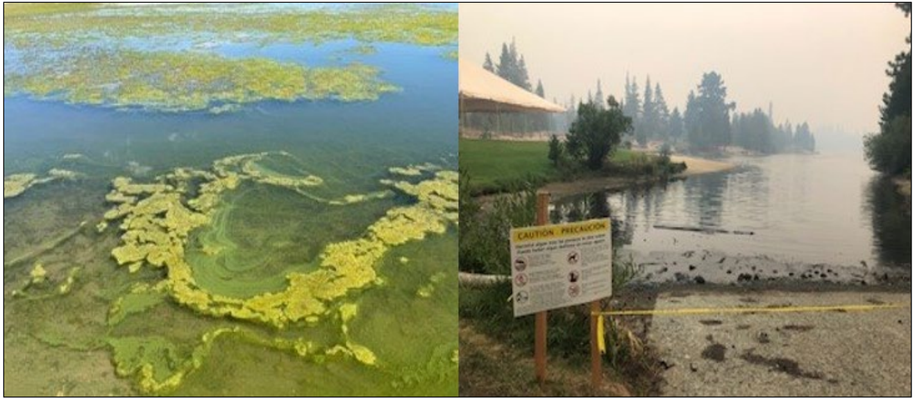
Figure 2.2: Photo of Crowley Lake on the left and Lake Baron on the right. Samples taken at Crowley Lake resulted in a danger advisory. Lake Baron placed a caution advisory after a suspected human illness and lab results confirming caution level HAB.