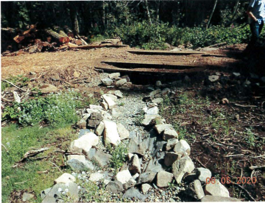
Photo 18. Modified watercourse, permanent watercourse crossing, disturbed soil in SEZ, woody debris and logs stockpiled in SEZ