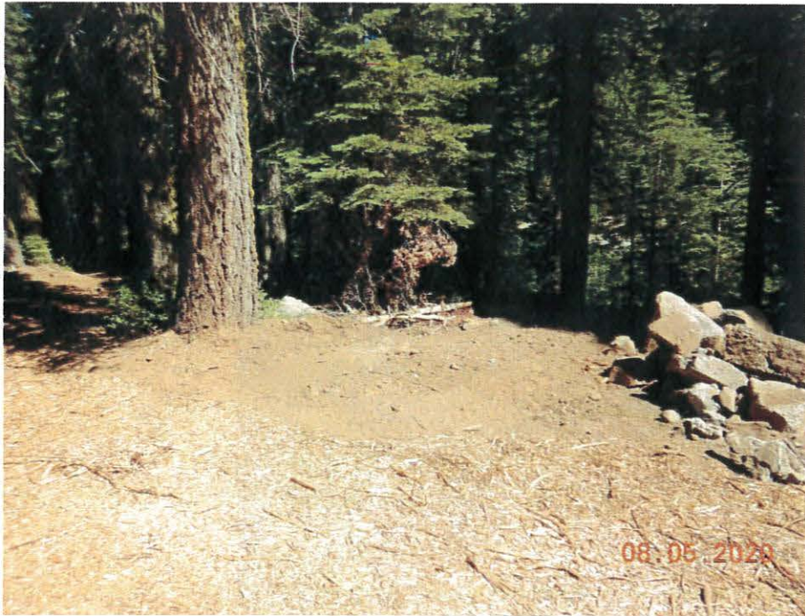
Photo 5. Disturbed soil area partially stabilized with wood chips.