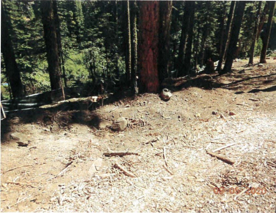
Photo 12. Windrowed soil adjacent to road surface partially stabilized with wood chips.