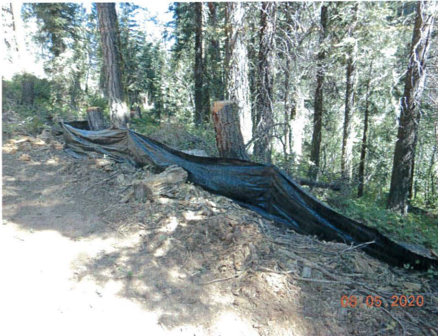
Photo 10. Downslope perimeter sediment control BMP.