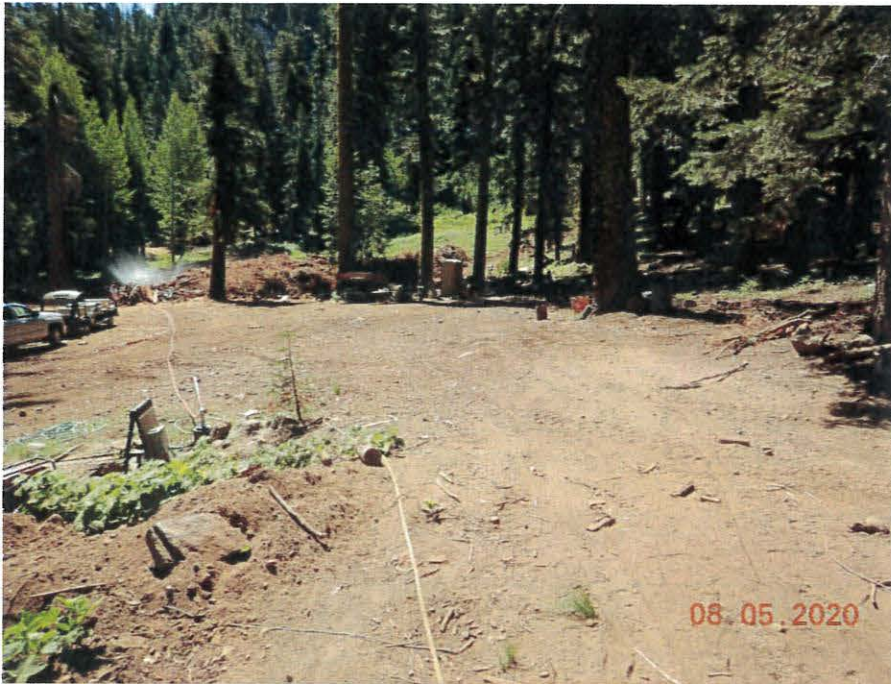
Photo 1. General site view showing recently cleared open area, windrowed soil and rock, slash pile, and small log deck.

Representative photos (of the 130 photos in the project files) included below were taken by Jim Carolan on 8/5/2020 using Nikon Coolpix W300 camera.