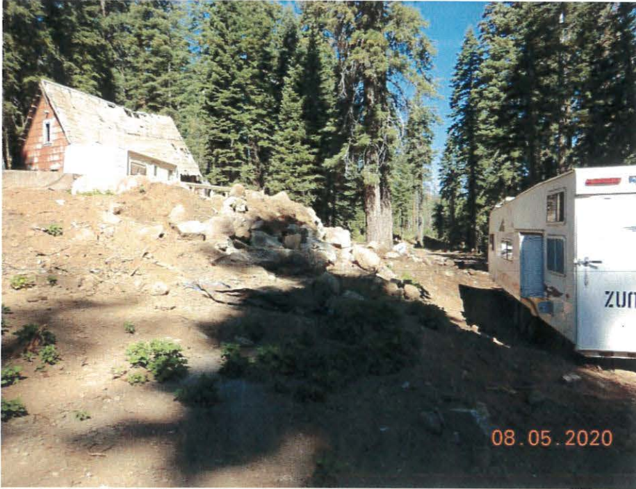
Photo 4. Stockpiled soil and rock.