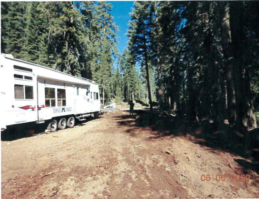
Photo 6. Recently cleared area.