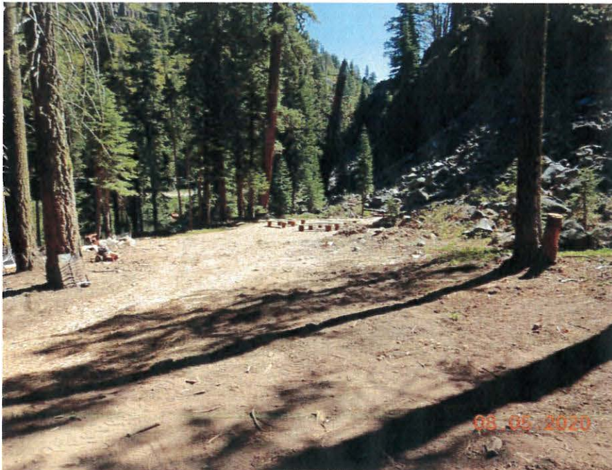
Photo 13. Recently cleared area partially stabilized with wood chips.