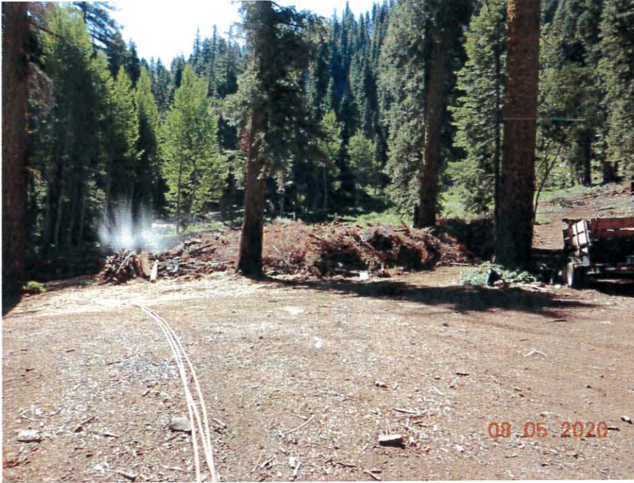
Photo 2. Recently cleared, partially stabilized open area with wood chips, slash pile, and small log deck.