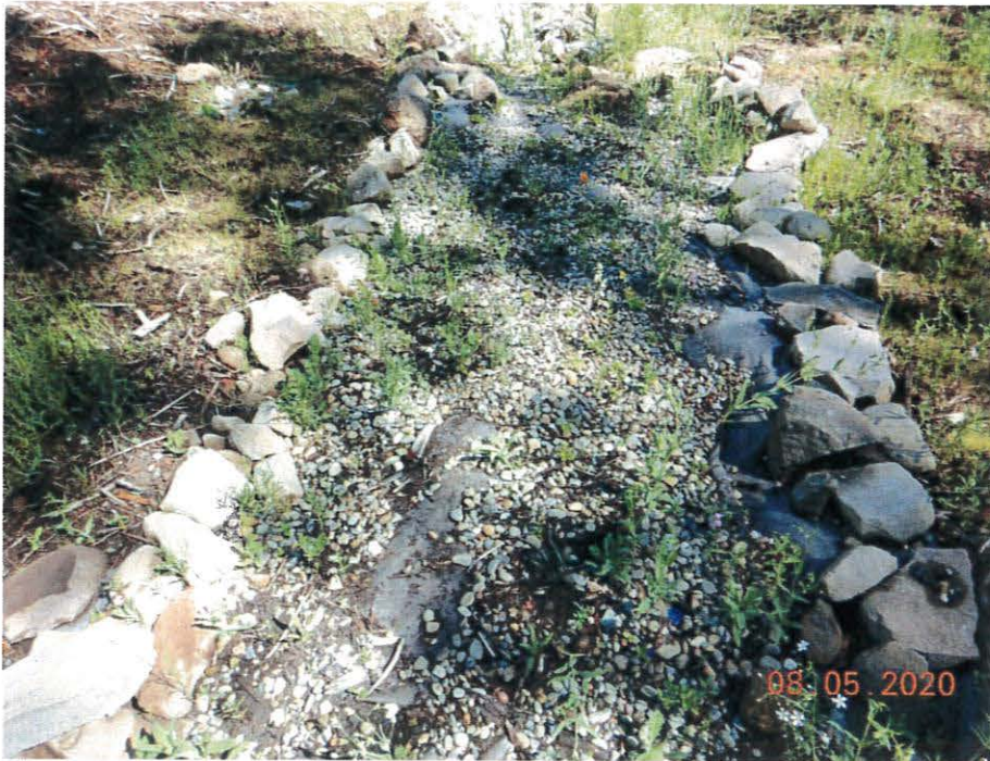
Photo 16. Modified watercourse: straightened, lined with geotextile, covered with gravel, bordered with cobbles.