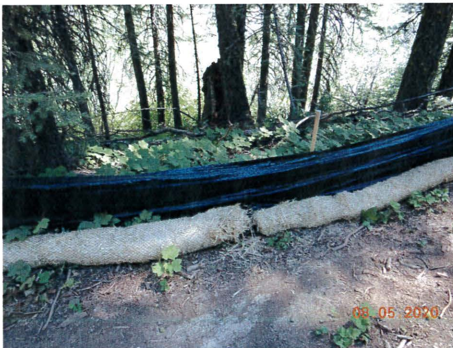
Photo 11. Downslope perimeter sediment control BMPs.