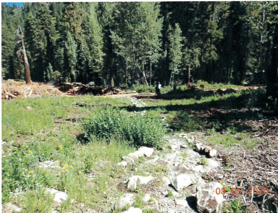
Photo 15. Modified watercourse extending from upland spring to Truckee River.