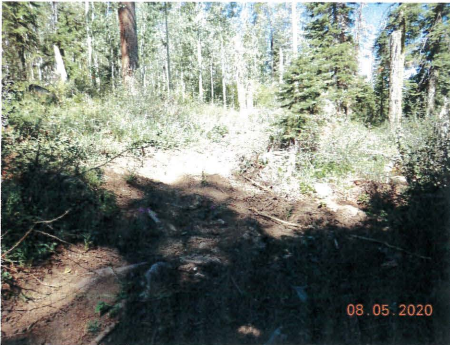
Photo 9. Temporary access road that may extend into SEZ.