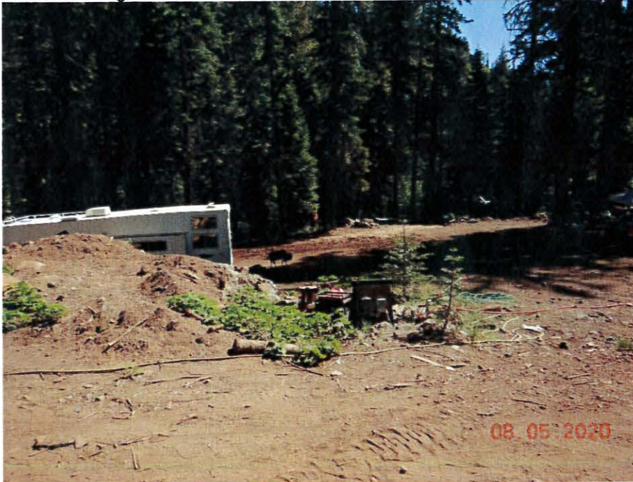
Photo 3. Recently cleared area and stockpiled soil and rock.