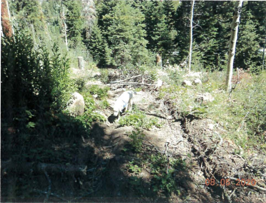
Photo 8. Temporary access road. Ruts resulting from heavy equipment driving on saturated soil.