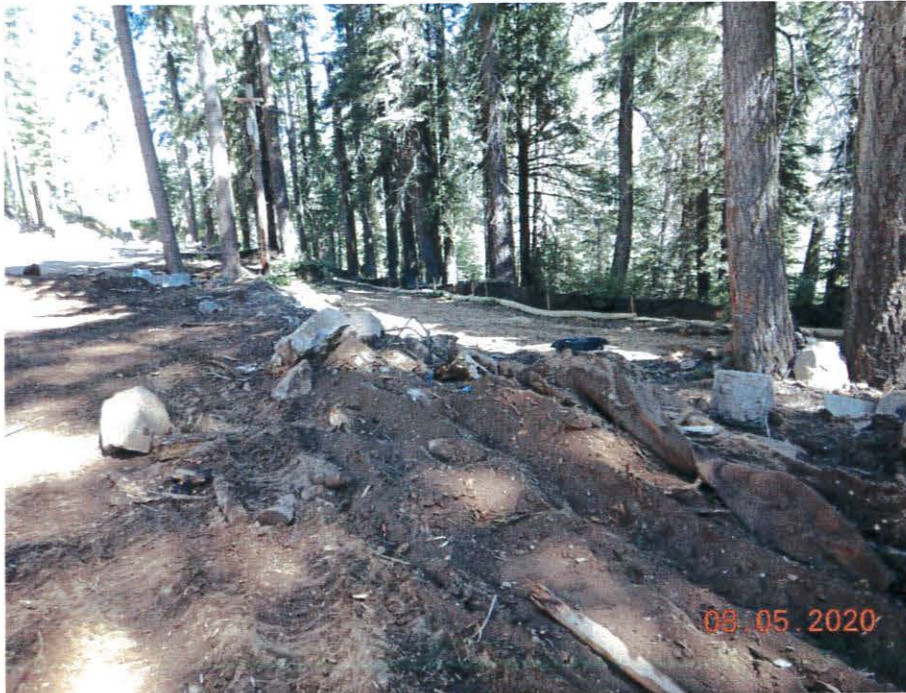
Photo 7. Windrowed soil and rock, downslope perimeter BMPs