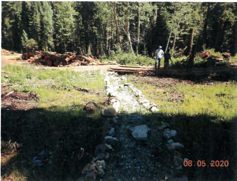
Photo 17. Modified watercourse, permanent watercourse crossing, disturbed soil in SEZ, woody debris and logs stockpiled in SEZ.