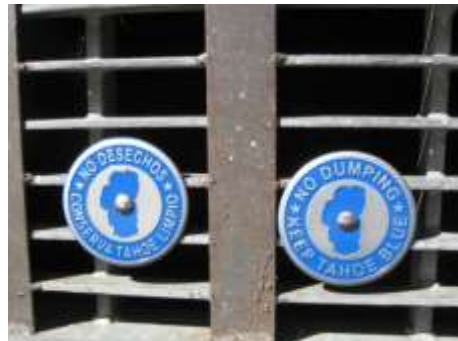
Storm drains marker, detail