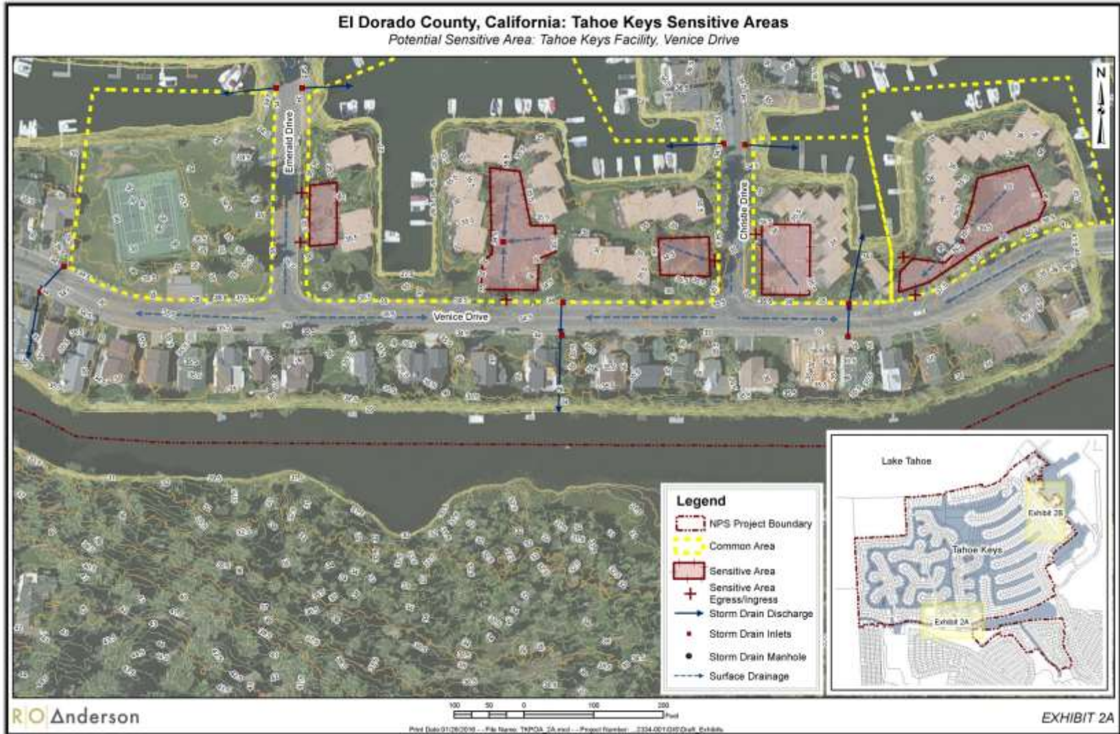
Figure 2A: Potential Sensitive Drainage Area: Venice Drive, South