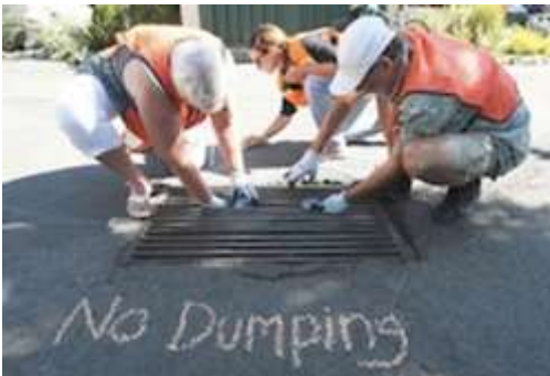
Volunteers marking storm drains

TKPOA members and Tahoe Keys residents are actively engaged in volunteer programs for protecting Lake Tahoe. For example, in 2014, residents helped Tahoe Keys become the first neighborhood in the Lake Tahoe Basin to mark all the storm drains with “No dumping – Keep Tahoe Blue” markers (see photos, below). In addition, TKPOA has hosted Pipe Keeper trainings for residents in the Tahoe Keys. This program trains citizens on how to monitor and report water quality in their area.