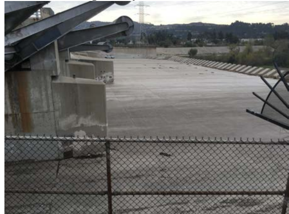
San Gabriel Spillway (downstream)