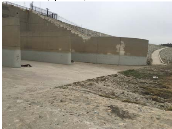
Rio Hondo (upstream)