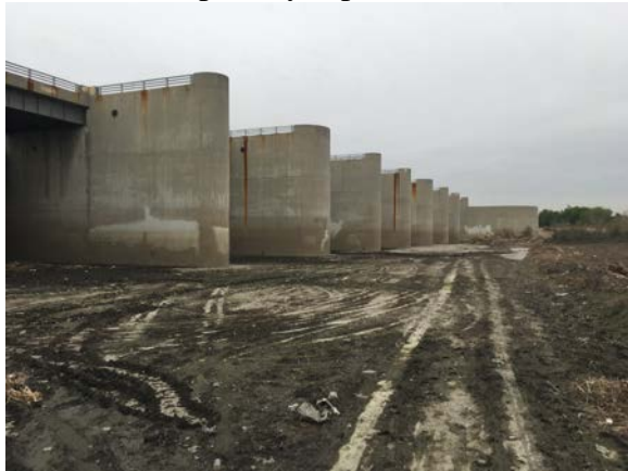
San Gabriel Spillway (upstream)