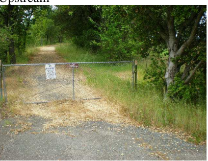
Downstream access to right of fence Laguna Watershed Monitoring Plan