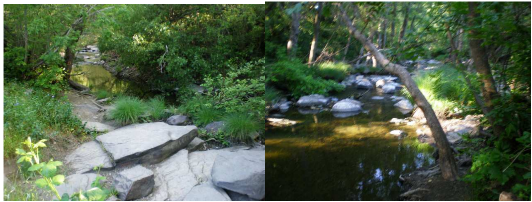
Santa Rosa Creek Upstream