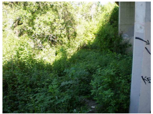
Access trail going east to the Laguna