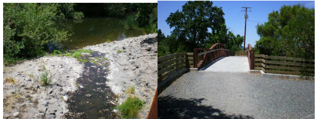
Mouth at Santa Rosa Creek