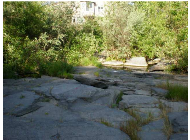
Brush Creek near mouth