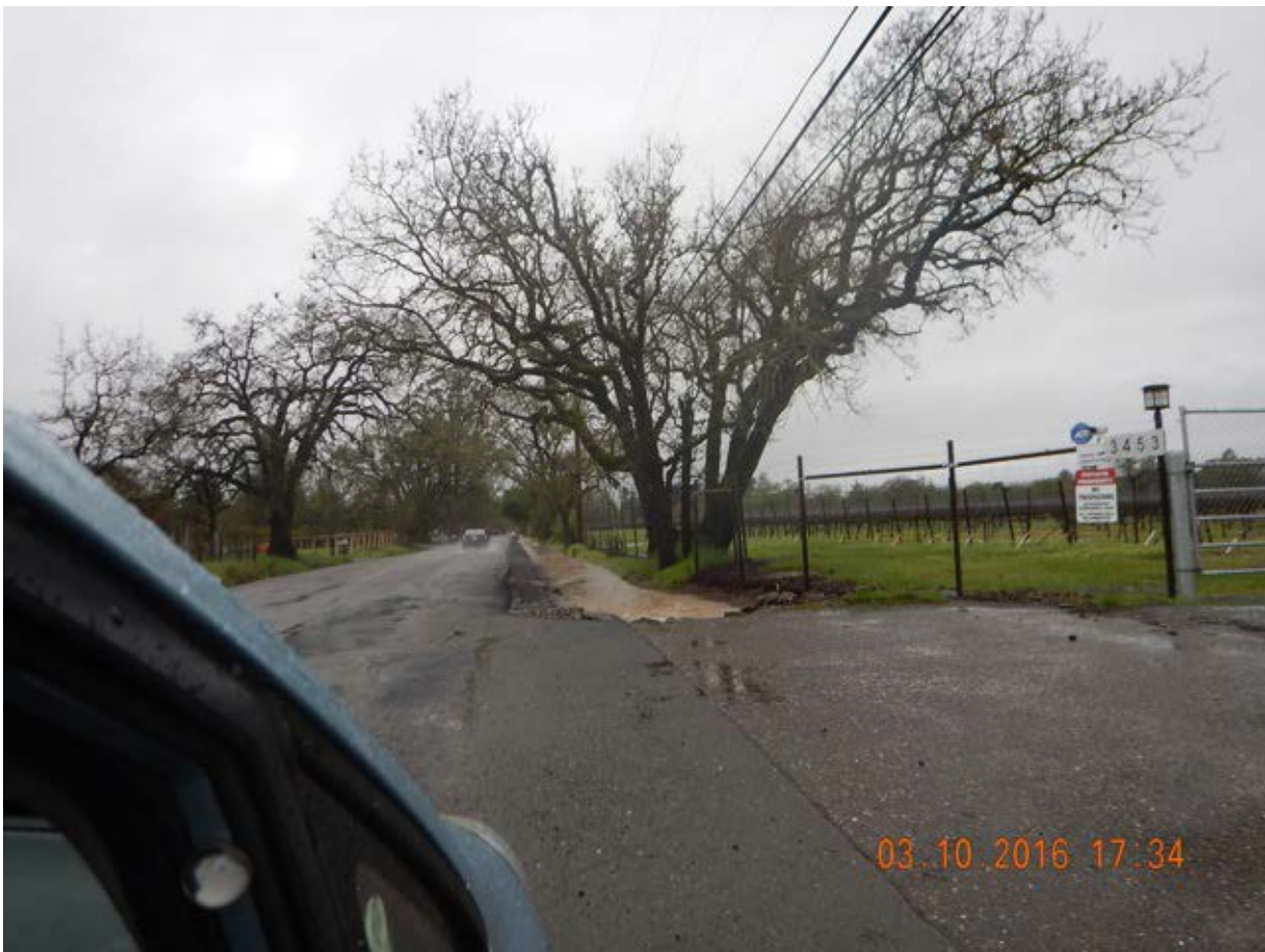
Piner Road, relatively flat vineyard. Sonoma County. Pollution heading to the Russian River.

Although known to be inadequate to maintain water quality, permits are still issued with the proviso that the permittee use best management practices (BMPs). When these fail, the discharger then enters the world of enforcement of water quality standards. Up front investment in effective technologies, permit requirements based on numeric limits, and management of an enterprise in a proper manner serves the goal of compliance and minimizes need for enforcement.