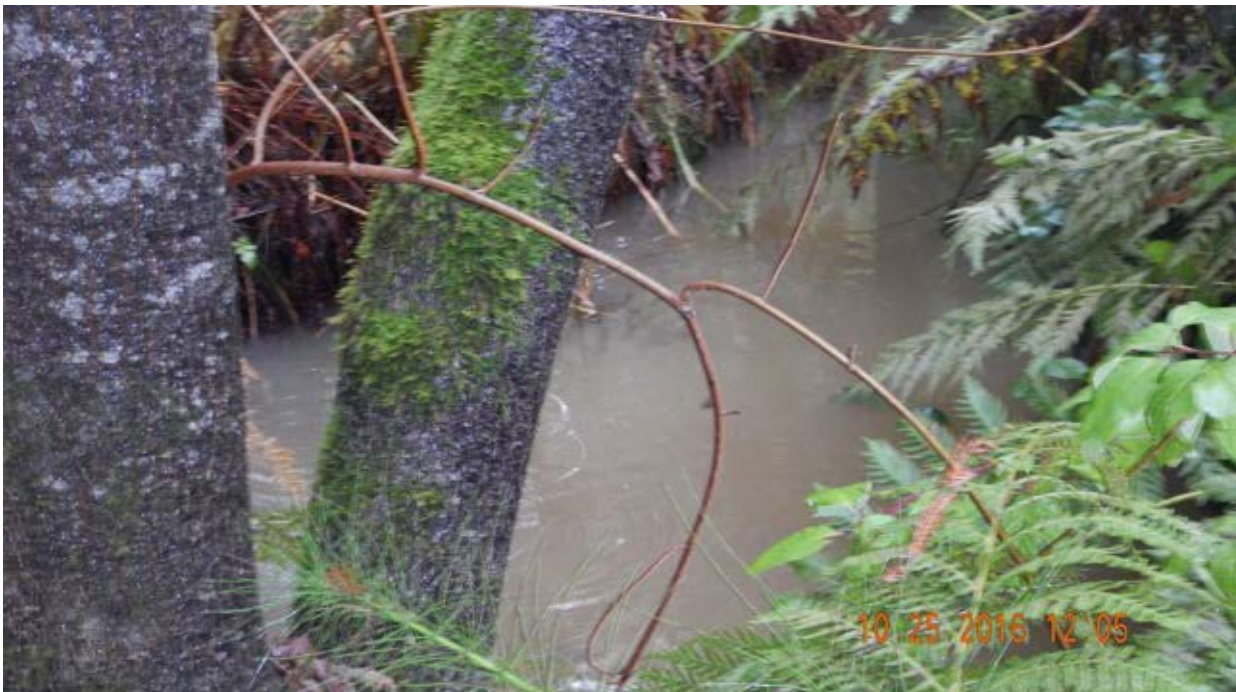
Upper Green Valley Creek....

Staff must have access to all lands where discharges threaten beneficial uses. On-site drop inlets, or the like, must have remotely accessible data loggers or other effective monitoring to ensure pollution does not leave a site and enter waterways. This will enable staff to properly do their jobs.