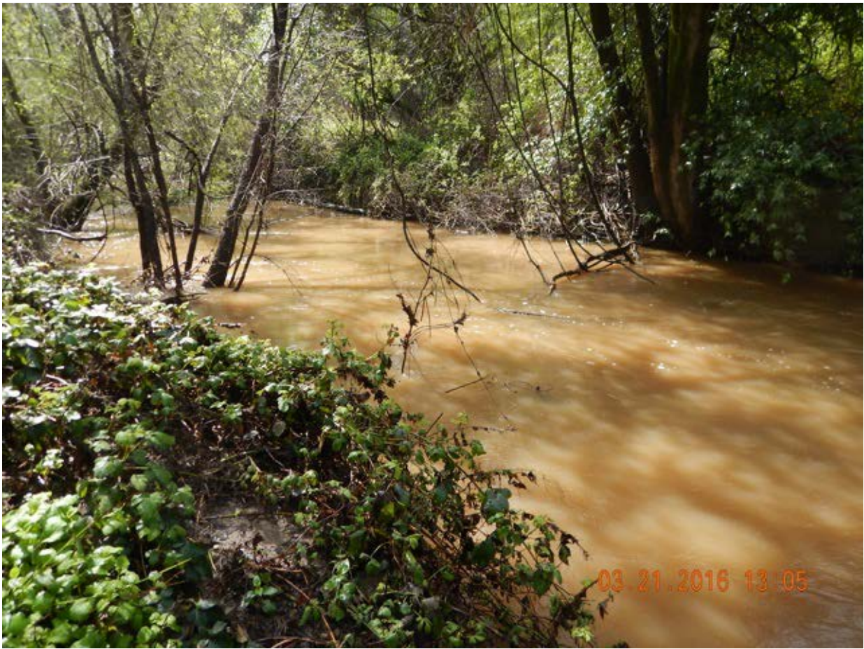
Lower Green Valley Creek.