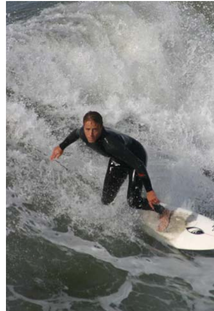
Surfer at Ocean Beach, San Diego County (2003) by Ed Chan