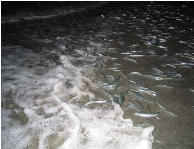
Grunion run at Ocean Beach, San Diego County (2004)