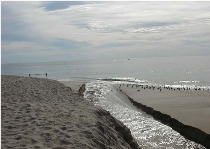
Aliso Beach, Orange County (2002) by Christina Arias

This amendment will revise the indices, table of contents, glossary, page numbers, and graphics in Chapter 3 (Water Quality Objectives) and Chapter 4 (Implementation) to reflect updates to text. The photographic images below will be added as graphics as well.