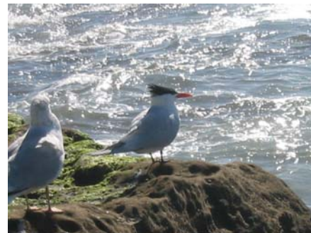
Elegant tern and seagull south of Children's Pool, San Diego County (2006)