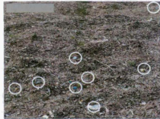
Photograph 10 – Green waste materials and various plastics (circled)