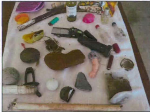
Photograph 9 – Various debris collected by the complainants from Site No. 1