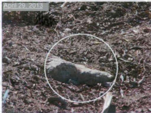
Photograph 11 – Green waste materials and concrete (circled) other debris