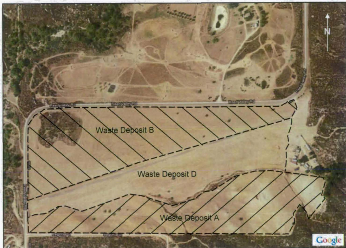
Figure 1 – Aerial view of Site No. 1 (~152 acres).

Figure 1 and photograph 7, and figure 2 and photograph 8 (provided below) illustrate the relative size and estimated coverage of wastes discharged to land at Sites Nos. 1 and 2, respectively.