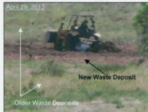
Photograph 2 – Spreading waste at Site No. 1