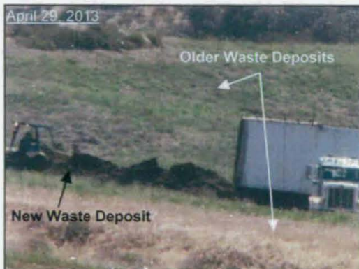
Photograph 1 –Waste discharged at Site No. 1

During the April 29, 2013 inspection of Sites Nos. 1 and 2, San Diego Water Board staff observed wastes actively being discharged to land (see photographs 1 and 2 below) at Site No. 1, and visual evidence supporting complainant allegations that wastes have been discharged at Site Nos. 1 and 2 since August 2011 (see photographs 3 through 6 below).