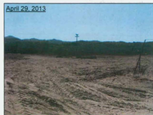
Photograph 4 – Waste discharged at Site No. 2