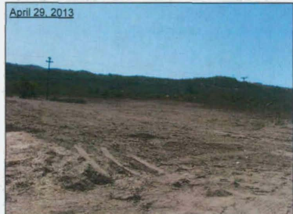
Photograph 8 – South-east facing view of Site No. 2

Wastes deposited at Sites Nos.1 and 2 consist primarily of green waste materials (i.e., landscaping wastes) and lesser quantities of glass, plastics, metals, and construction debris (see photographs 9 through 12 below). San Diego Water Board staff estimates the average thickness of the waste discharged at Site Nos. 1 and 2 is 2 feet, and covers an approximate area of 162 acres (Site No. 1, ~152 acres; Site No. 2, ~10 acres). Based on these values, the approximate total volume of waste discharged is 432,720 cubic yards.