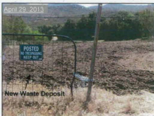
Photograph 3 –Waste discharged at Site No. 2