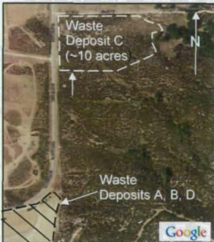
Figure 2 – Aerial view of Site No. 2.