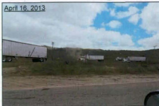
Photograph 5 5 – Waste haulers at Site No. 2