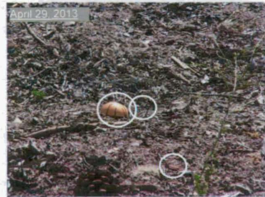
Photograph 12 – Green waste materials and various plastics (circled)