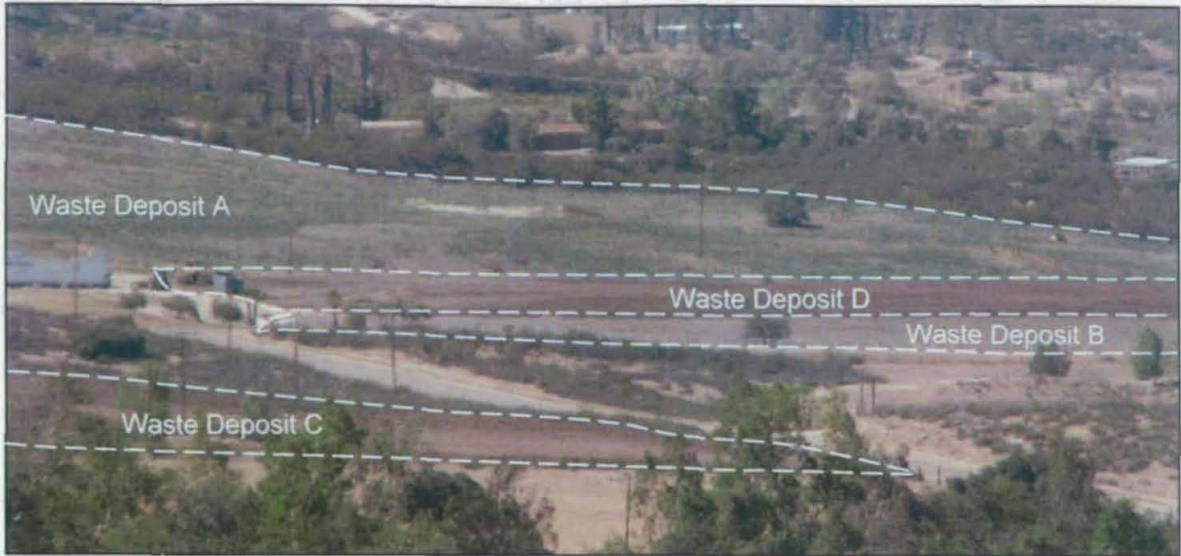
Photograph 7 – South facing view of Site No. 1.