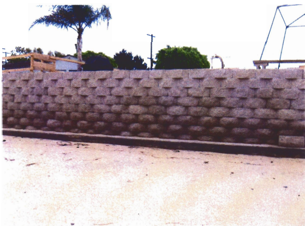
Figure 3. Looking west at 501 First Street