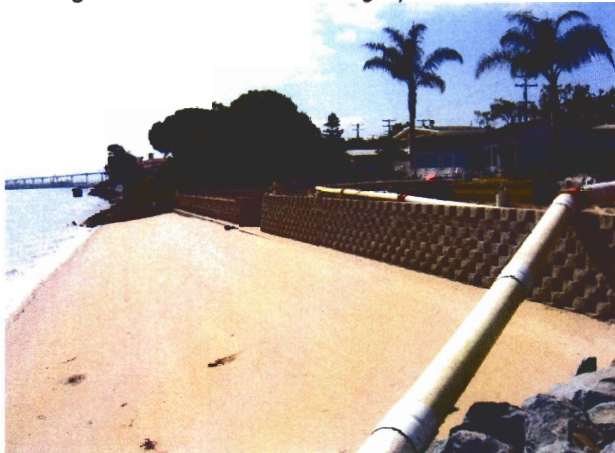
Figure 1. 6/12/06 inspection. note that concrete footing is covered across a large portion of seawall.