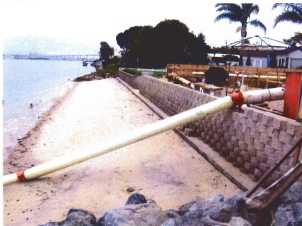
Figure 2. 9/14/06 Concrete footing is completely exposed between 6-7 inches along entire length of seawall.