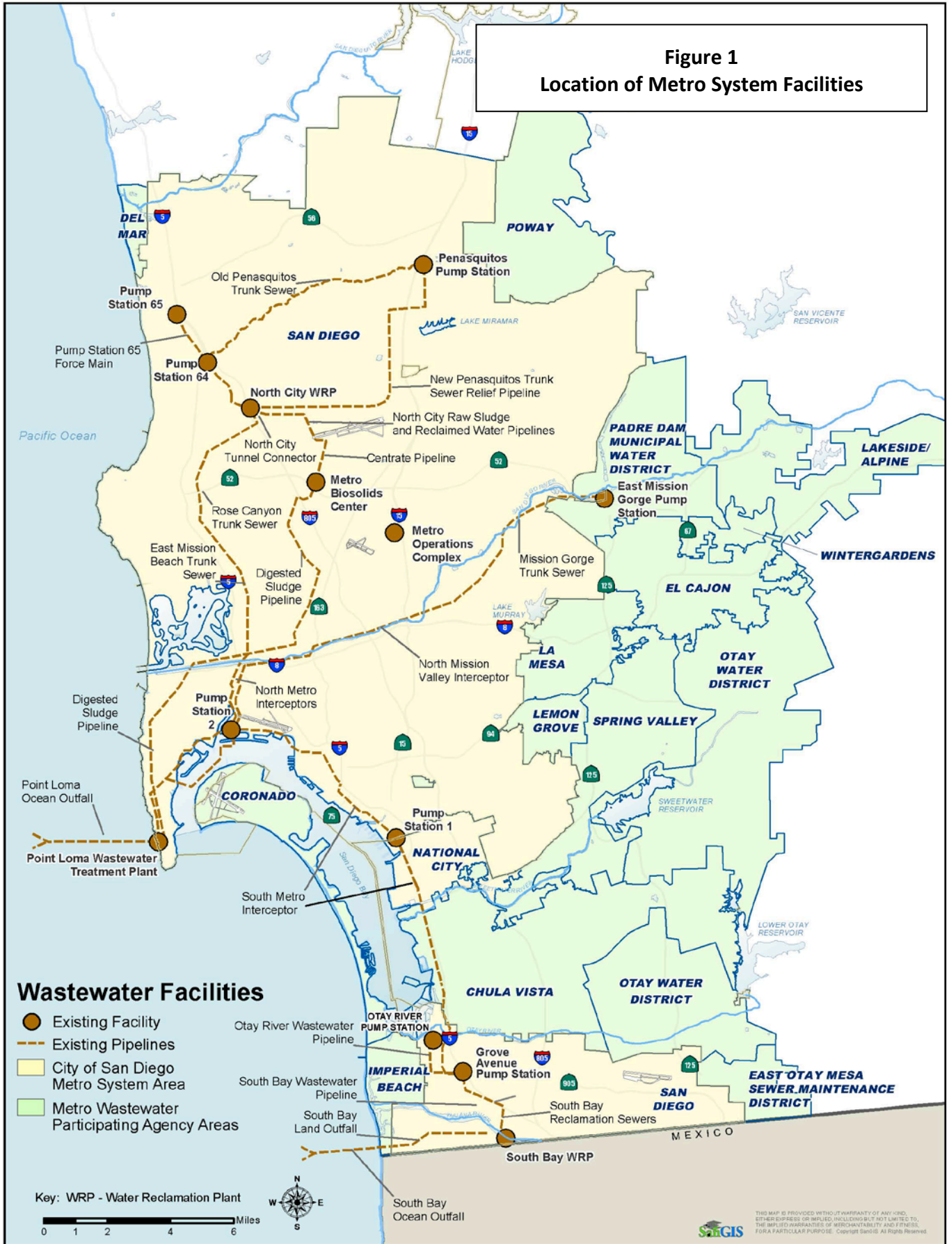
Figure 1 Location of Metro System Facilities