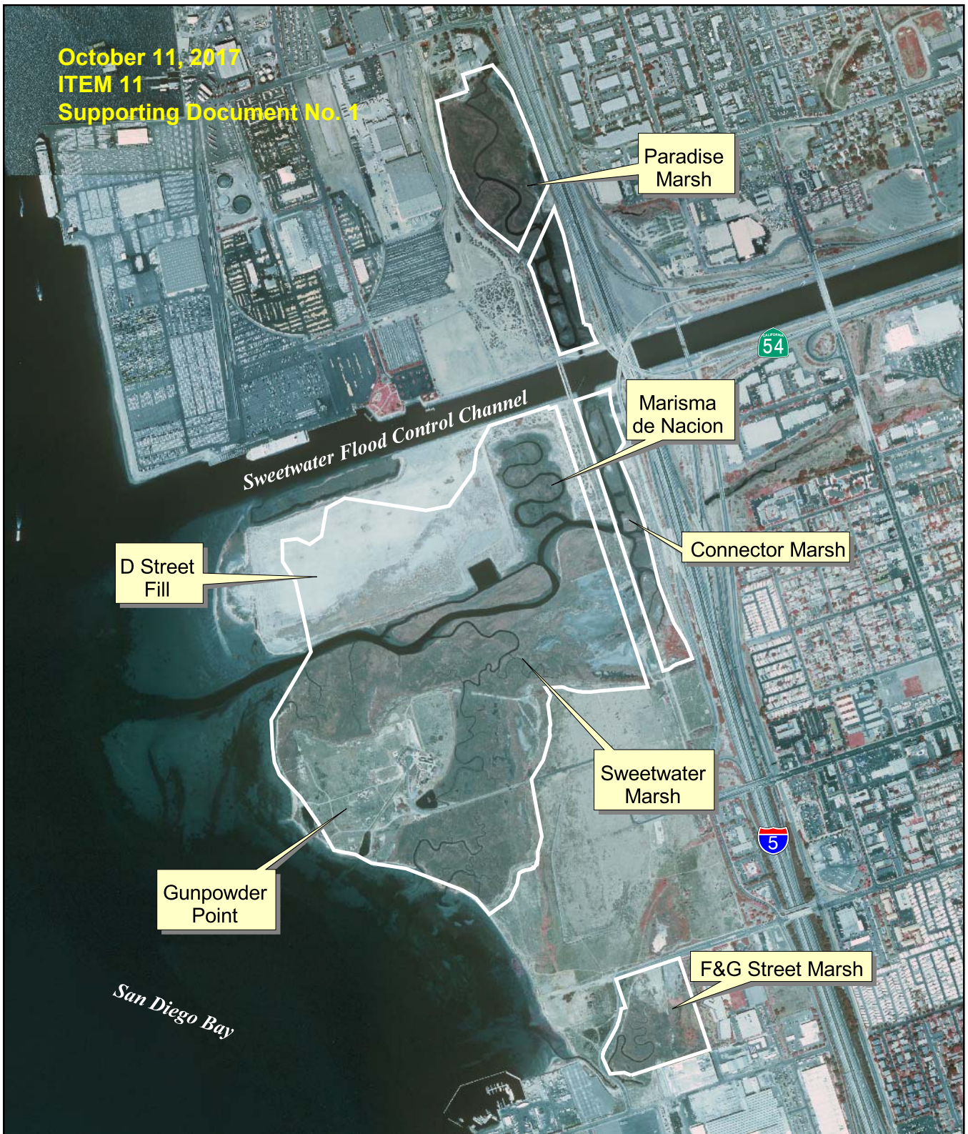
Figure 1-3 Aerial View of the Sweetwater Marsh Unit

October 11, 2017 ITEM 11 Supporting Document No. 1