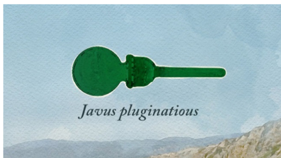
LID SIPPER PLUGS