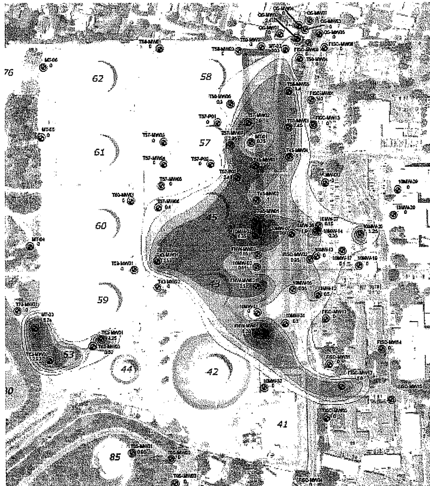
May 2007 Fuel Plume Map