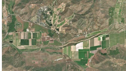
San Pasqual Valley