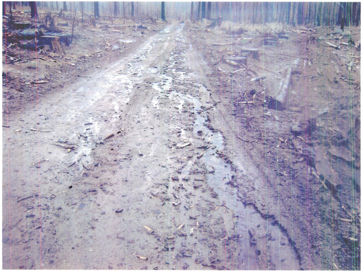
Photo 1: Forest Road 17E49, north of Seneca Pond in Unit 5 on October 13, 2009. No erosion control structures are installed.