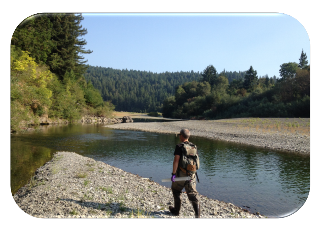
Sampling the Navarro River in Mendocino County.