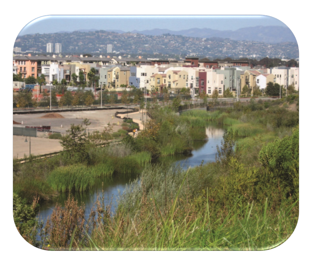
Urban stream near the southern California coast.

SPoT will begin its sixth year of watershed monitoring in April 2013. Given the evidence that pesticides are associated with ambient toxicity in California waters, certain emerging pesticides will be prioritized as SPoT monitoring proceeds. Because of increasing use and the potential for surface water toxicity due to fipronil, this pesticide has been included for statewide monitoring starting in 2013. Legacy pesticides, PCBs and organophosphates will be monitored less often.