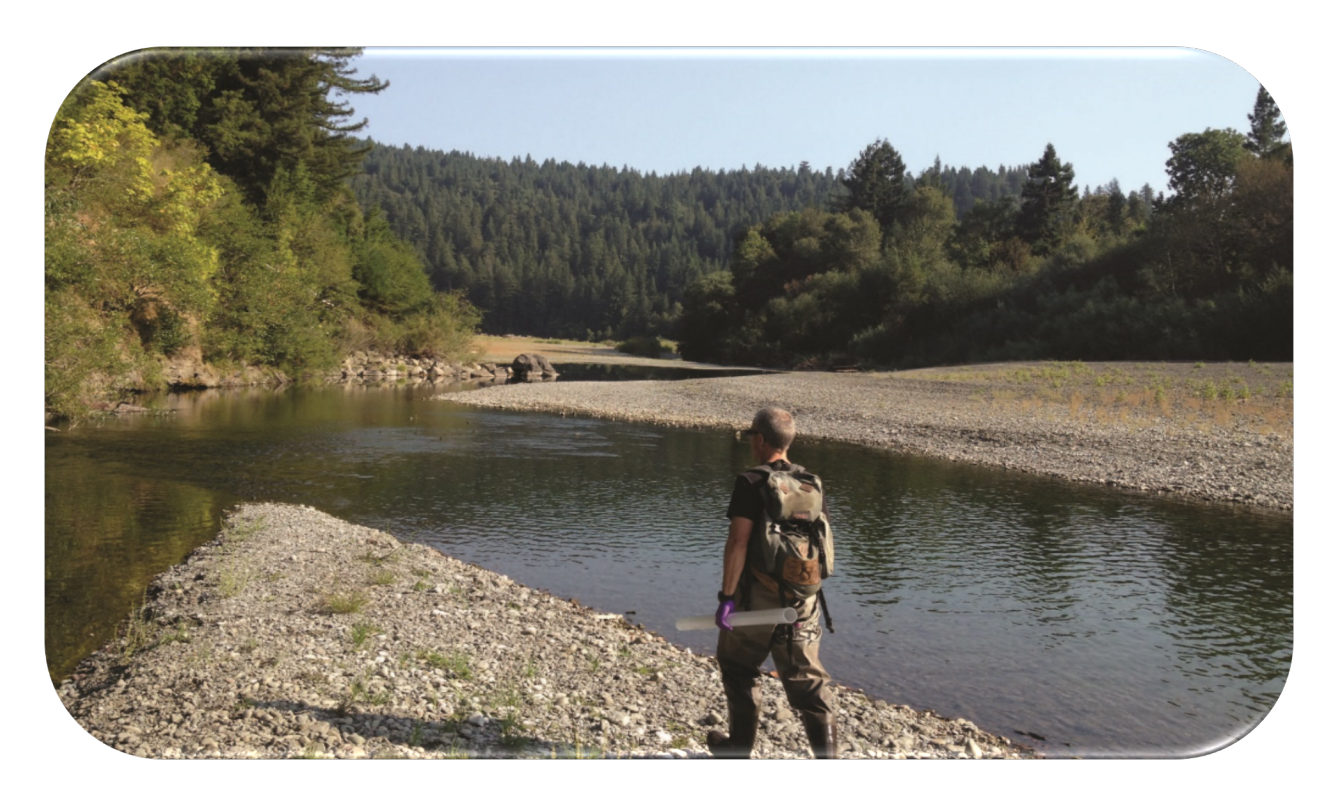
Sampling the Navarro River in Mendocino County.

Algal toxins have recently been found in polluted waterbodies throughout California and certain cyanotoxins have been associated with liver toxicity in marine mammals. In a new collaboration with California State University Monterey Bay, SPoT will measure microcystin-LR in stream sediment interstitial water beginning in 2013.