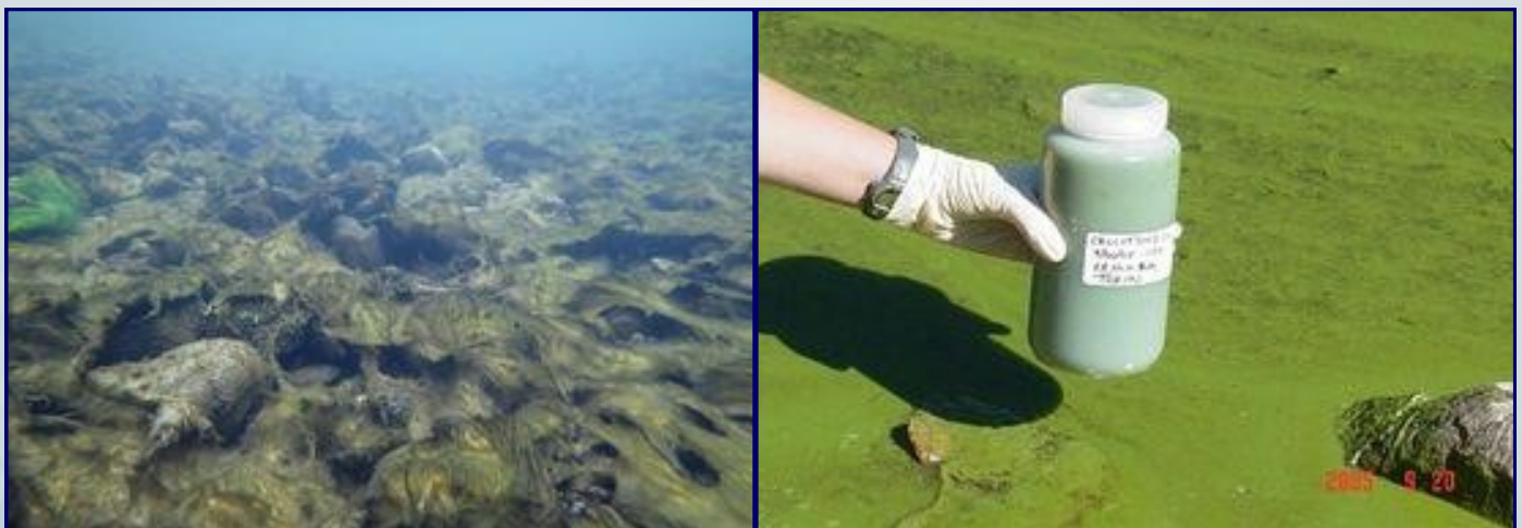
Figure 1. Left panel – benthic bloom; Right panel – planktonic (floating) bloom

Benthic blooms originating on the substrate of North Coast Rivers are very different from planktonic (floating) blooms that originate in lentic (still) waters of lakes and reservoirs (Figure 1). HABs in lentic waters are caused by free-floating, planktonic cyanobacteria cells. Measuring HABs and their associated toxins in this environment poses fewer challenges and uncertainties than sampling within streams and rivers. In lakes and reservoirs, the water column is relatively stable and the location of nuisance blooms is more easily identified. Planktonic HABs are readily analyzed using grab water column sample collection, and researchers have been studying planktonic HABs for many years since they are common throughout the United States and the world.