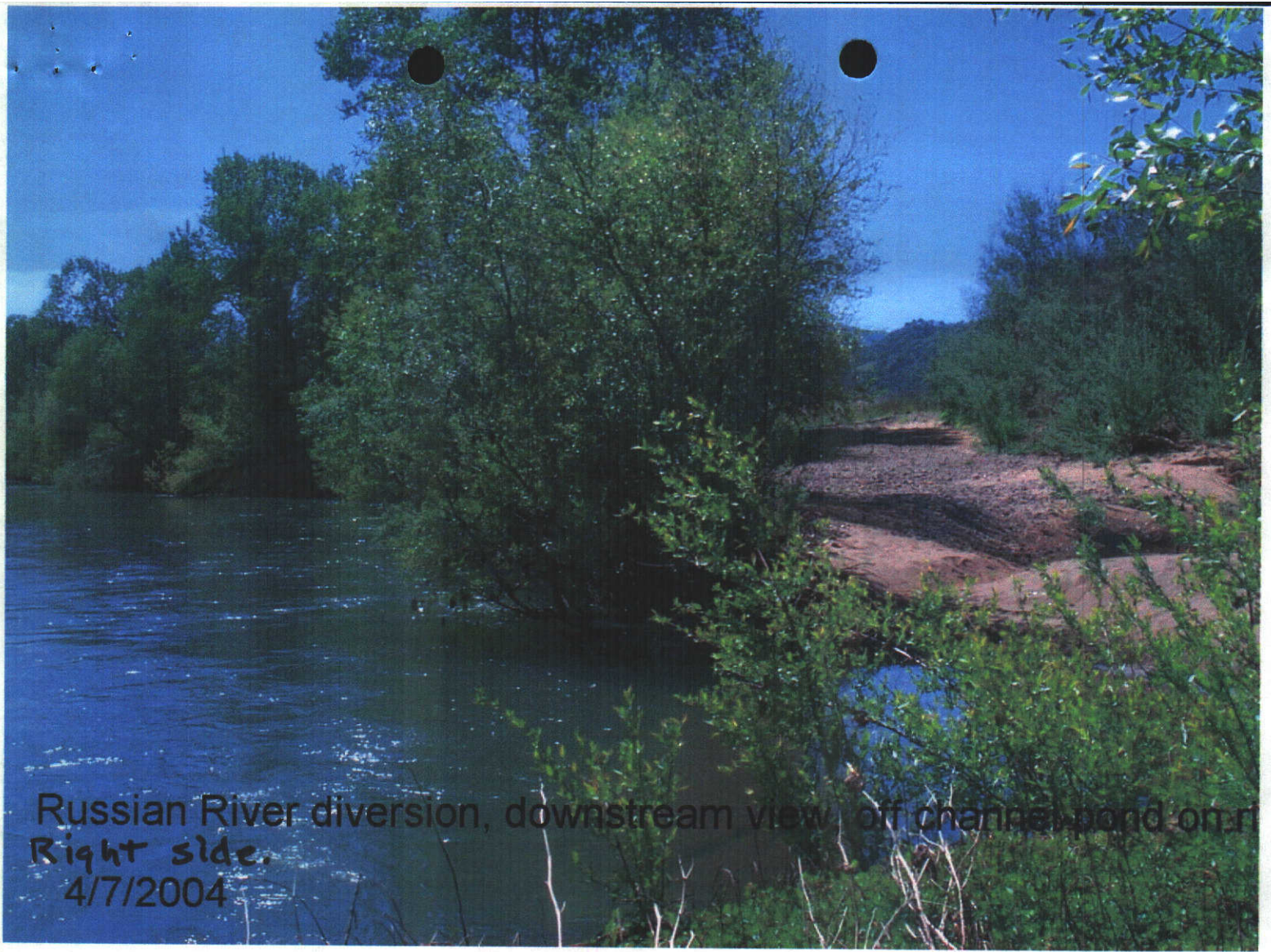
Russian River diversion, downstream view, of channel pond on r Right side. 4/7/2004