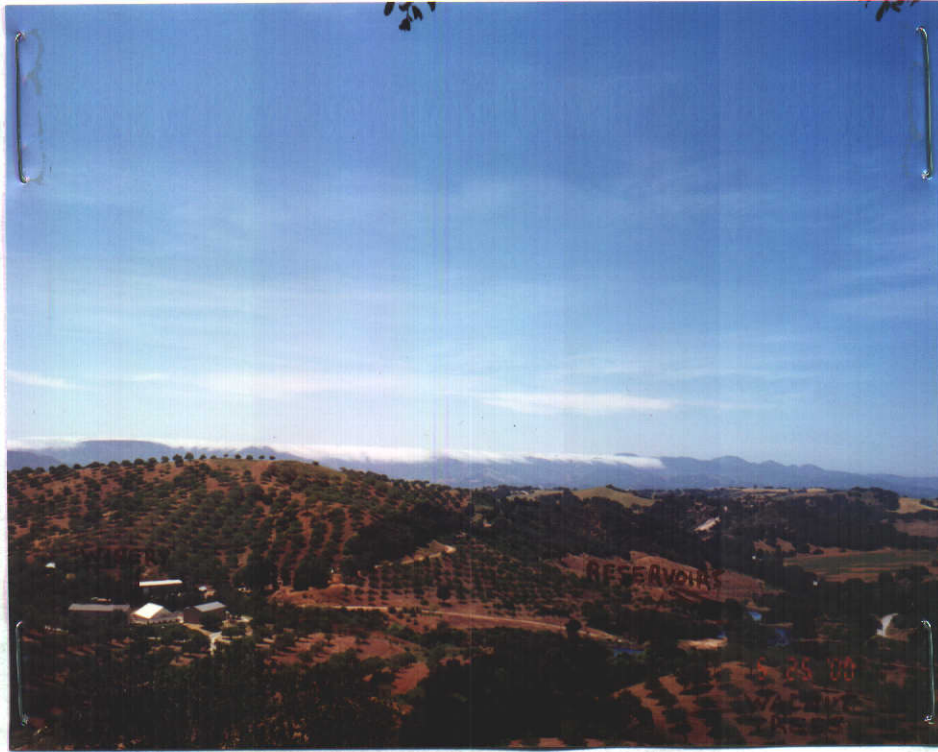
VIEW FROM AMPHITHEATER