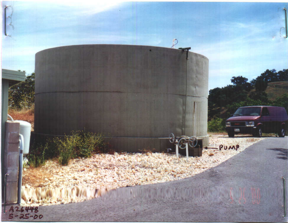
35,000 GAL STORAGE TANK