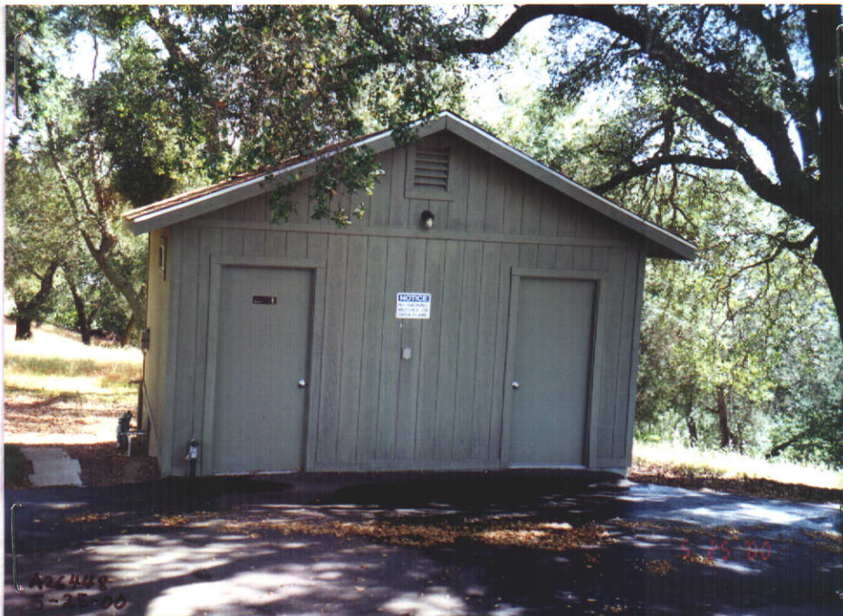
BATHROOMS FOR AMPHITHEATER