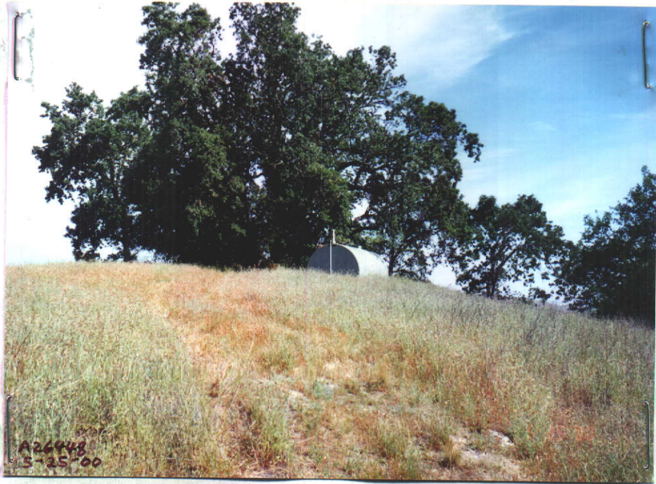
10,000 GAL STORAGE TANK