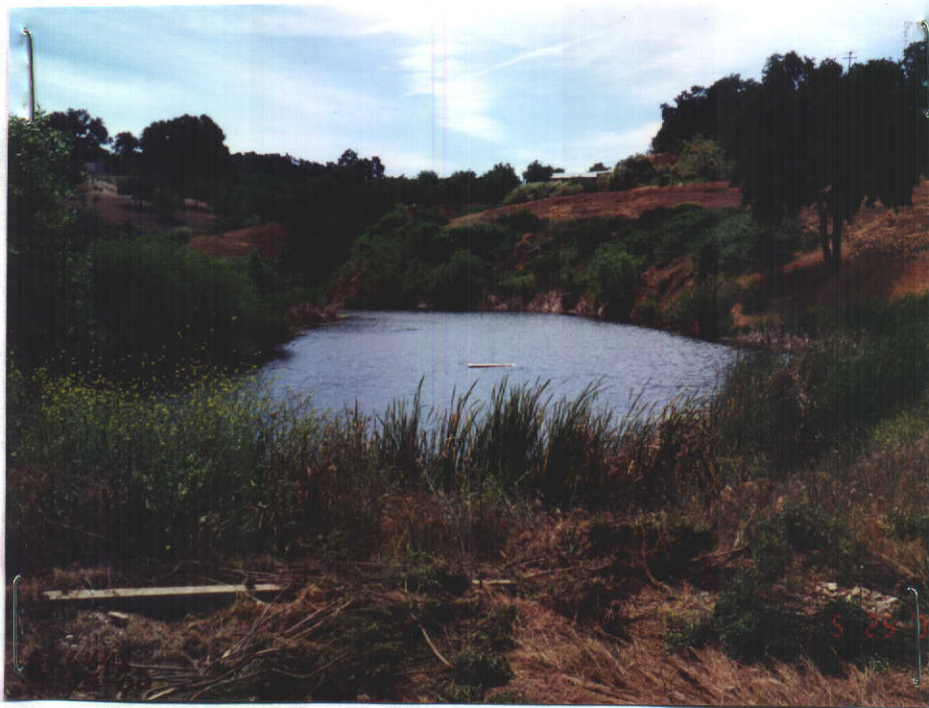
RESERVOIRS 3 AND 4