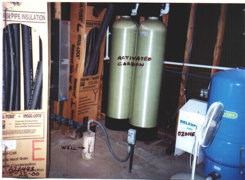
WATER TREATMENT AT WINEAY