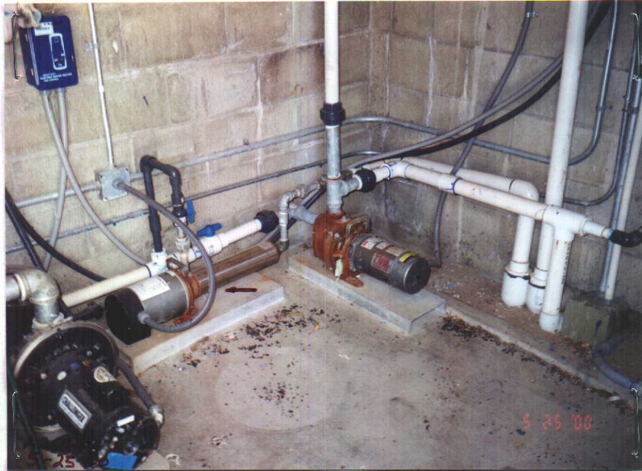
1 H.P. PUMP AT WINERY - PUMPS WATER UP TO 35,000 GAL TANK