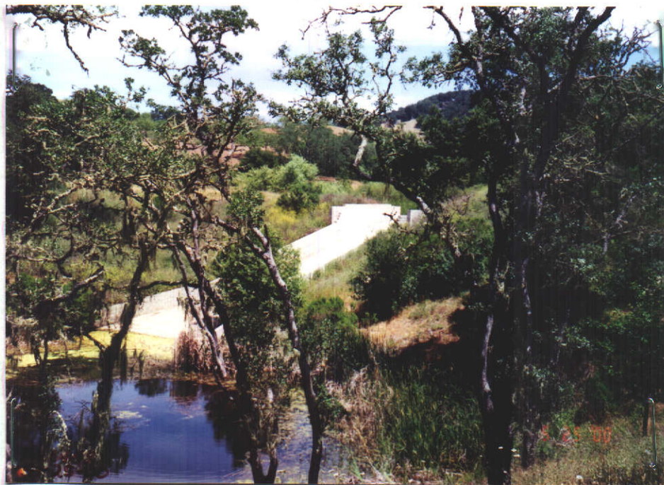
SPILLWAY TO RESERVOIR 2