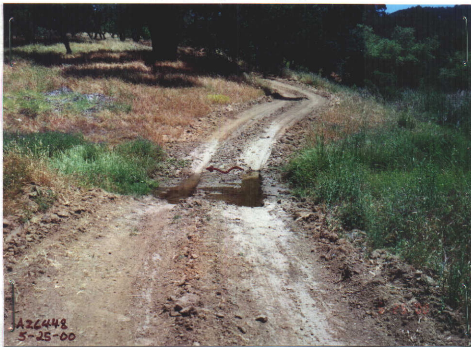
SPILLWAY FOR RESERVOIR 1