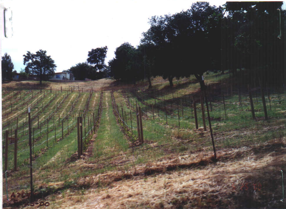
5.0-ACRES VINEYARD AND HOUSE